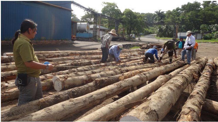
Photo: The group measuring the length and diameter of the logs

The weight to volume conversion factor for planted Kelampayan and Eucalyptus pellita logs will be determined by comparing the results from both field measurement and laboratory testing.