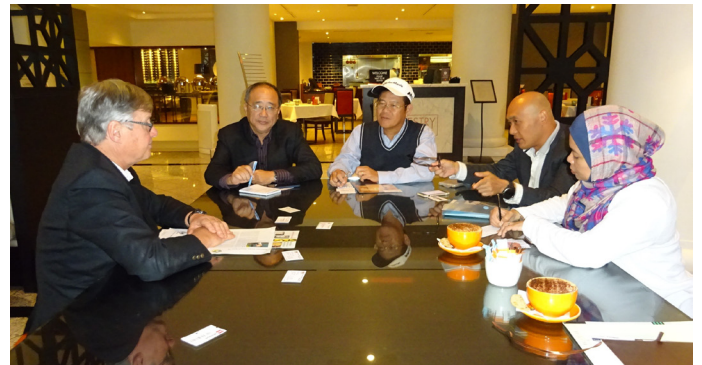
Photo: Discussion with a timber and timber products importer