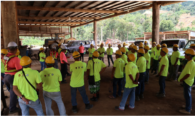
Photo: Briefing by DOSH officer during the site inspection

Following the paper presentations, participants of the Campaign were divided into eight (8) groups to conduct group exercise on HIRARC, based on different logging activities such as tree felling, log extraction, road construction, log loading and etc to identify hazards, risk assessment and risk control in each activity. A ground inspection was also conducted by DOSH officers to evaluate the compliance of OSH requirements in Berkakap Camp.