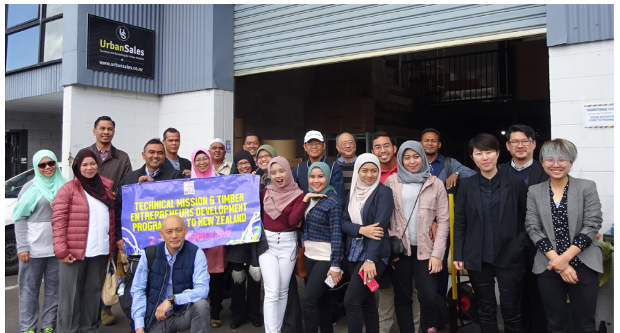
Group photograph at Sue-e furniture Auckland outlet

The main products New Zealand imports from Malaysia are wooden furniture, BJC, sawntimber, fibreboard, wooden frames, mouldings and plywood while Malaysia buys veneer, sawntimber, fibreboard, logs and plywood from New Zealand.