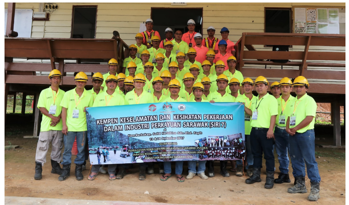
Photo: Group photo with participants

Siri ke-7 Kempen Keselamatan dan Kesihatan Pekerjaan (OSH) dalam Industri Kayu telah dianjurkan oleh Perbadanan Kemajuan Perusahaan Kayu Sarawak (STIDC), Jabatan Keselamatan dan Kesihatan Pekerjaan (DOSH) Sarawak dan Persatuan Kayu Kayan Sarawak (STA) dari 13 hingga 14 September 2017 di Kem Berkakap, Kapit.