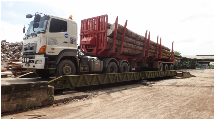
Photo: Weighing the Kelampayan logs on weighbridge

Siri kedua Kajian Nisbah Penukaran Berat kepada Isipadu untuk Kelampayan dan Eucalyptus pellita telah dijalankan dari 11 hingga 14 September 2017 di Bintulu.