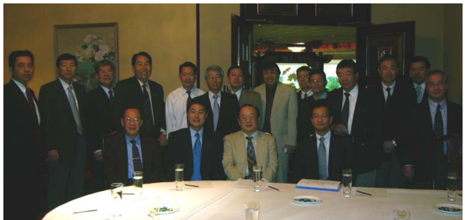
Picture: Delegates from the five associations