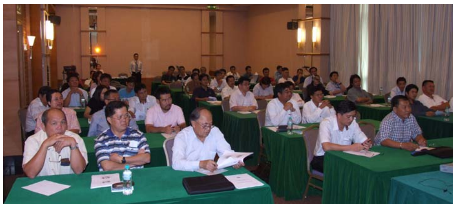
Picture: Participants at the briefing session

STA dengan kerjasama Majlis Pensijilan Kayu Malaysia (MTCC) memberi taklimat tentang syarat-syarat untuk Pensijilan Rantaian Jagaan (CoC) di bawah skim MTCC pada 21 September 2007 di Wisma STA, Kuching.