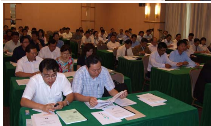
Left: Participants at the Course