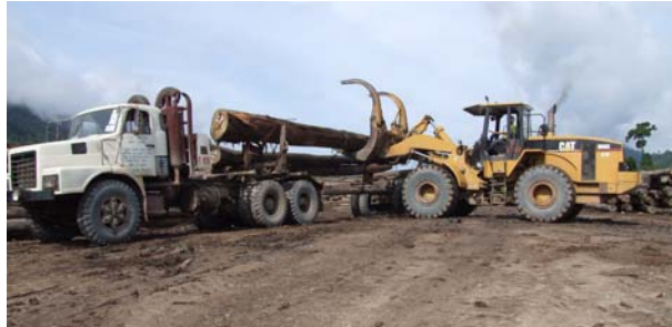
Picture: Log Loading

The main objectives of the briefing were to inform the participants on (i) the status of Section 54B Forests Ordinance (Sarawak, Cap 126), (ii) various courses offered by STA Training Sdn Bhd, (iii) financial contributions available for training, and (iv) the