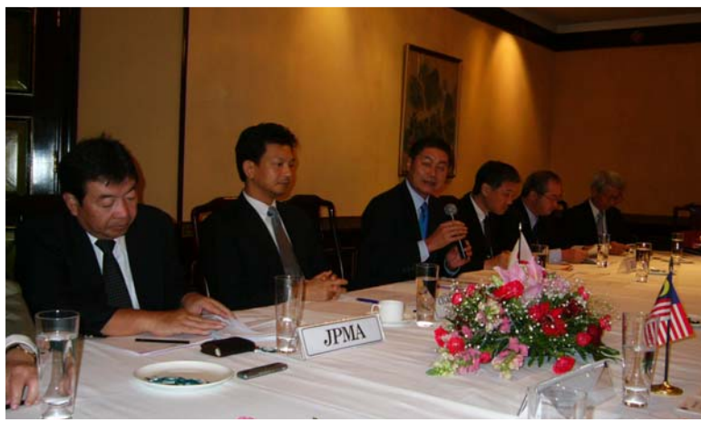
Right: Delegates from JLIA and JPMA