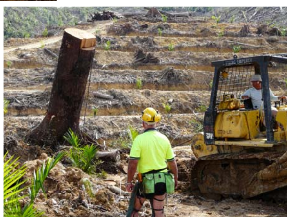
Right: Excavator operator under training

Usaha memaju ladang hutan oleh ahli STA pada masa akan datang, memerlukan tenaga kerja mahir yang tinggi. STA Training Sdn Bhd dengan kerjasama Grand Perfect Sdn Bhd mewujudkan dua set kemahiran dalam bidang ini iaitu, Sijil dalam "Clear-fell Site Preparation" dan Sijil dalam "Mechanical Site Preparation (Excavator)". Encik Kenneth Fergusson dari New Zealand akan memberi latihan ke atas set kemahiran ini.