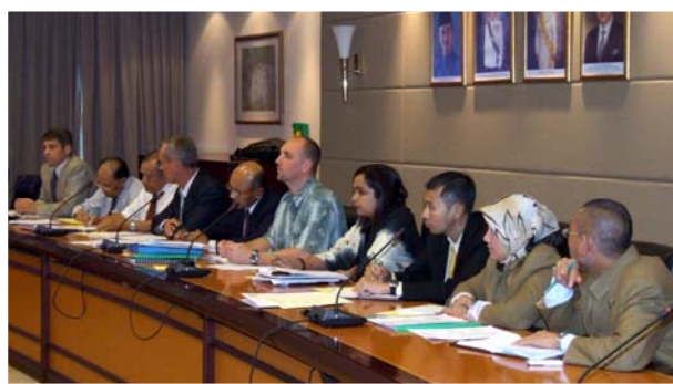
Below: The Evaluation Team