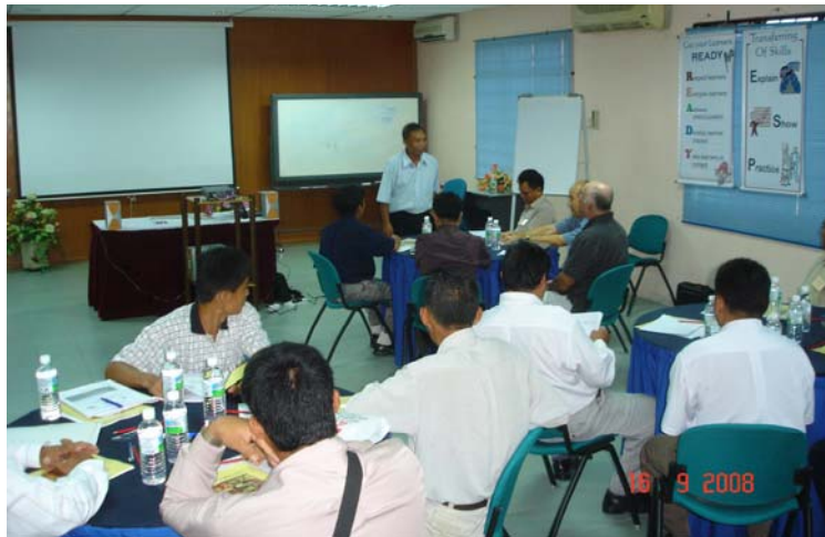
The Course in session

Sebagai sebahagian Program Pembangunan Pelatih, STA Training Sdn Bhd telah mengadakan "Train-The-Trainer Course: Conducting On-Job Training for Adults" dari 15 hingga 19 September 2008. Kursus ini bertujuan untuk menyediakan pelatih dengan pengetahuan dan kemahiran dalam menyampaikan latihan kemahiran kepada pelajar dewasa.