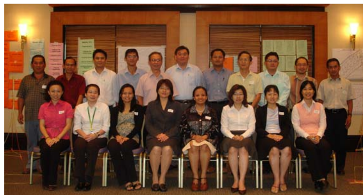
Right: Group photo of participants at the Workshop