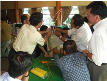
Top left, Top right, Left, Below Left: Participants in group discussion on case studies, analysing of various issues, how conflict arises and working together as a group