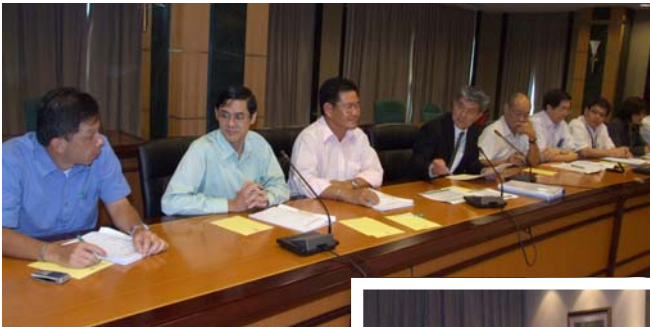
Left: Members of STA

On 10 September 2008, the team paid a visit to STA where they met up with Members of the STA Certification Committee. ❁