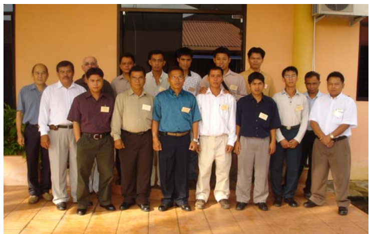
Course participants and the trainers