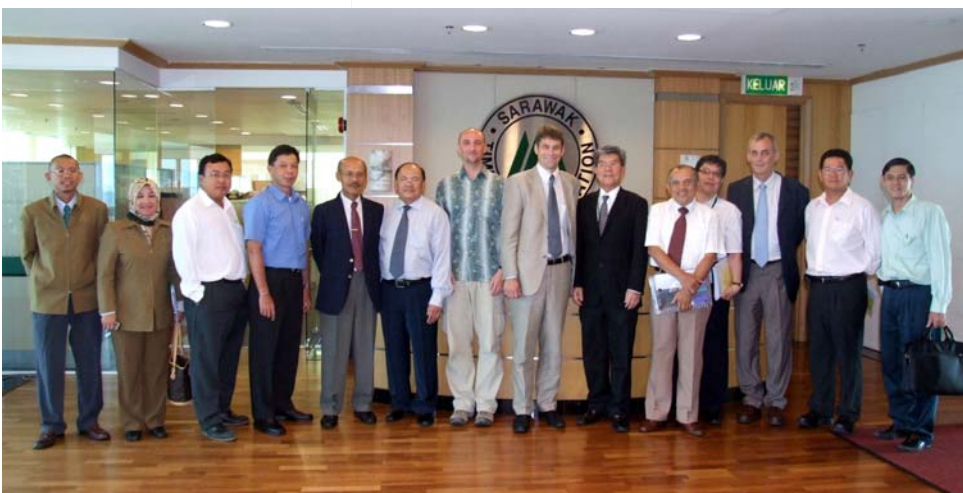
Below: Group photo

Pasukan Penilaian untuk Penilaian Teknikal Bebas Bersama untuk Sistem Perlesenan Malaysia di bawah FLEGT-VPA telah mengadakan lawatan ke Sarawak dari 9 hingga 17 September 2008. Lawatan ini dikendalikan oleh Perbadanan Kemajuan Perusahaan Kayu Sarawak. Tempat-tempat yang dilawati termasuklah kawasan pembalakan, kilang-kilang, kawasan eksport dan import dan pihak berkuasa dan agensi-agensinya kerajaan yang berkaitan di tiga bahagian di Sarawak iaitu Sibu, Miri dan Bintulu.