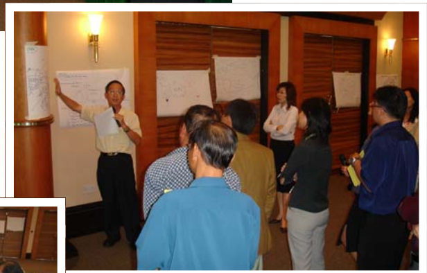
Right: A participant explaining the drawing of another participant