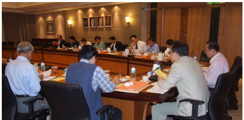
68 th Council Meeting in progress

A new Associate Member, WTK Heli-Logging Sdn Bhd was approved during the meeting under the Hill Logging Category. 🌲