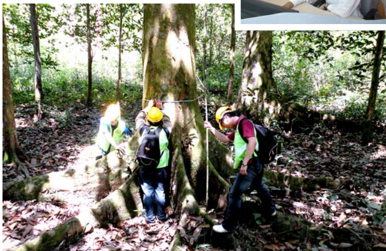
Left: Students learning the techniques of measuring trees at Semengoh Forest Reserve