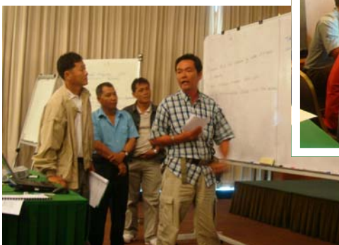
Left: Group presentation