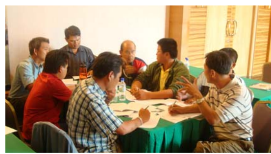
Below: Group discussion