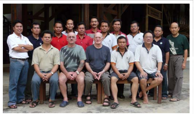
Right: Group photo of the participants together with the facilitator of the Workshop

Mulai 28 Septmber 2009, Konsulat Republik Indonesia telah berpindah ke alamat berikut.