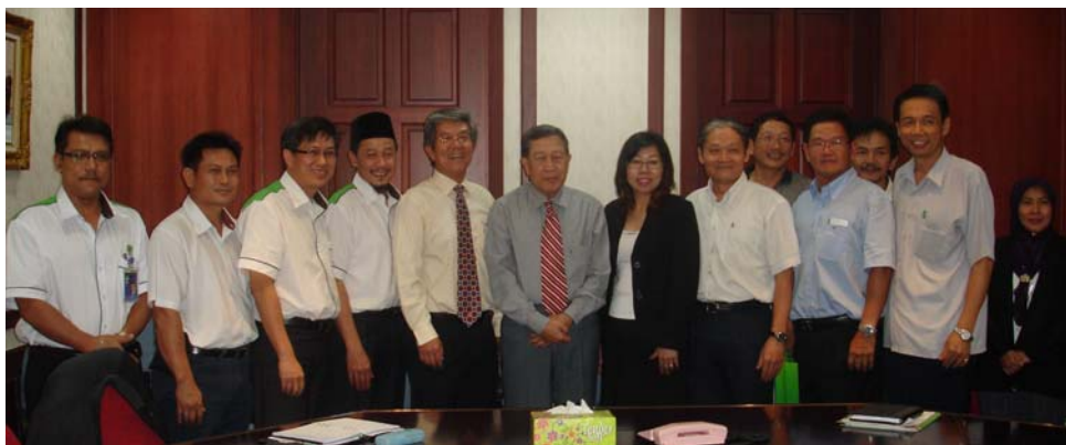
One for the album

At the dialogue, STA brought up various issues and problems that the industry might face when the process is being implemented. After discussing at length, Harwood has agreed to defer the implementation of the issuance of transportation passes for logs transported by land vehicles till further notice and until the industry has been fully consulted. ❁