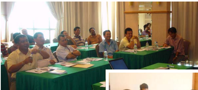
Left: Briefing in session

Aktiviti-aktiviti yang dijalankan semasa bengkel termasuk sesi taklimat, perbincangan secara berkumpulan, sesi praktikal dan soal jawap yang merangkumi aktiviti-aktiviti berkenaan pra-penilaian, semasa dan selepas proses penilaian dijalankan untuk memastikan calon-calon didedah kepada pelbagai situasi yang akan dihadapi oleh penilai semasa menjalankan penilaian.