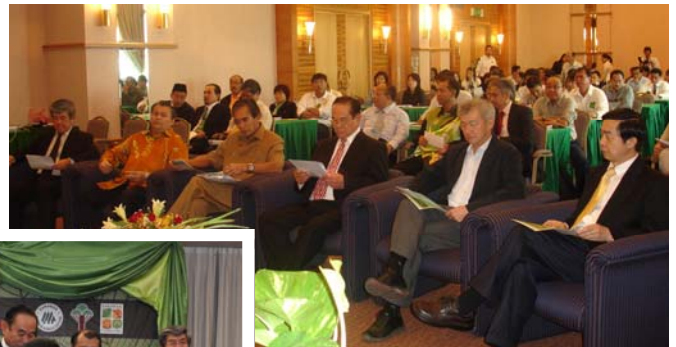
Right: Invited guests and participants at the Seminar

Note: Papers presented can be obtained from STA or Sarawak Forestry Corporation.