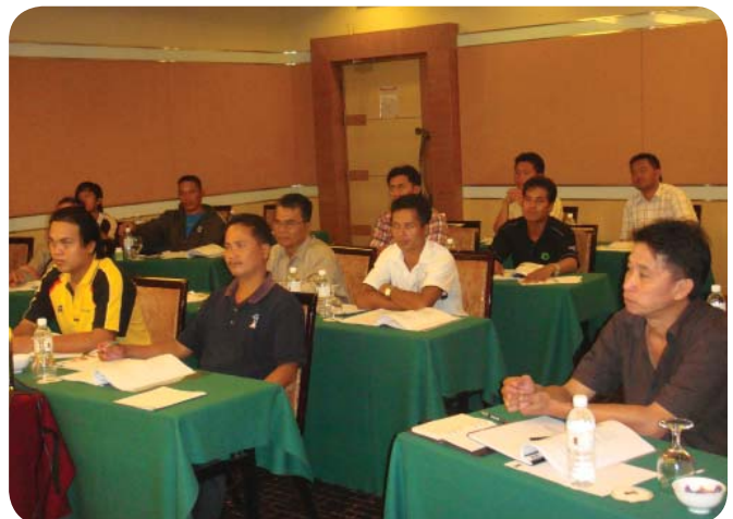
Photo: Course in progress

培训师完成为期5天的课程后，必须按各自所学到的技能，并在3个月期限内培训至少2位操作员。