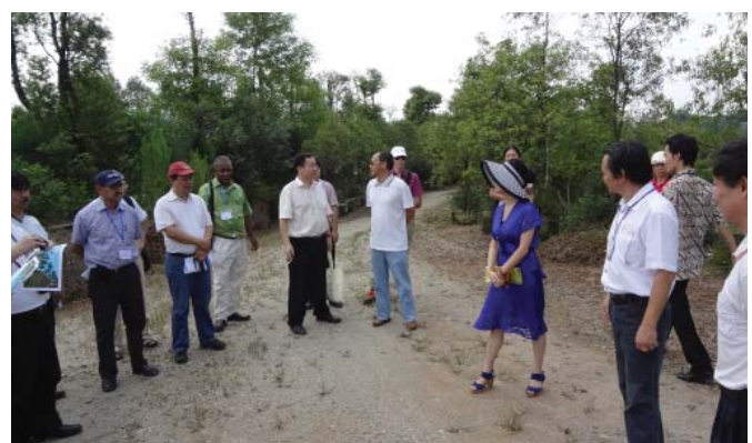
Photo: Welcome by the owners of Dragon Pearl Island Sandalwood Industrial technology Corporation Limited, a private sandalwood research base for sandalwood.

研讨会总共分为 2 部分, 各别呈现 9 份论文。参与者随后参与 2 项实地考察。