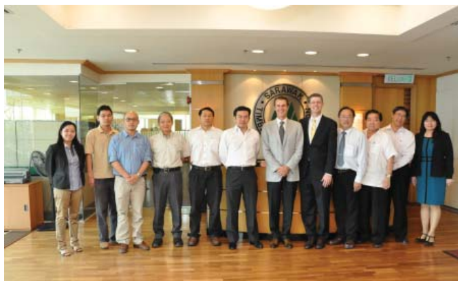
Photo: Group photo