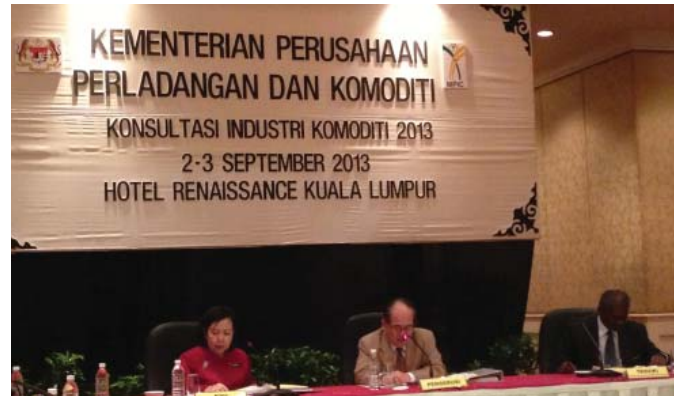
Photo: Session in progress

The Minister agreed to look into all the issues raised at this consultative session promptly.