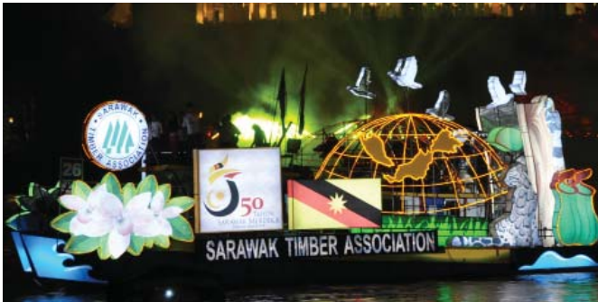
Photo: Float by Sarawak Timber Association

A series of celebrations were organised by the Sarawak State Government in conjunction with Sarawak's 50 years independence in Malaysia this year. One of the highlights of the celebrations was the River Floats Parade "River of Lights" coordinated by the Sarawak Rivers Board (SRB), which was held in the evening of 15 September 2013 at the Waterfront, Kuching.