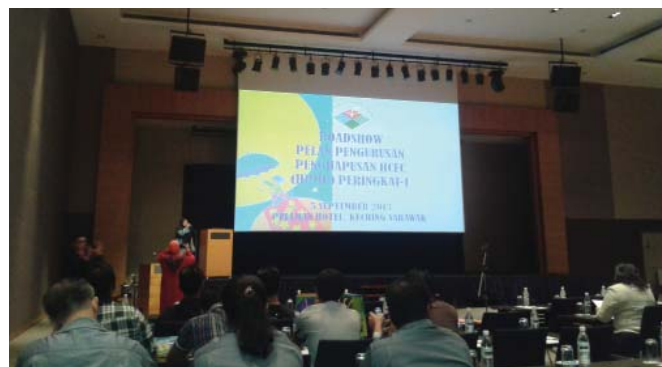
Photo: Roadshow in progress

Satu Jelajah mengenai Pelan Pengurusan Penghapusan (HPMP) Hydrochlorofluorocarbon (HCFC) Peringkat 1, Program Kesedaran 2012-2016 telah dianjurkan oleh Jabatan Alam Sekitar (JAS) pada 5 September 2013 di Hotel Pulman, Kuching.