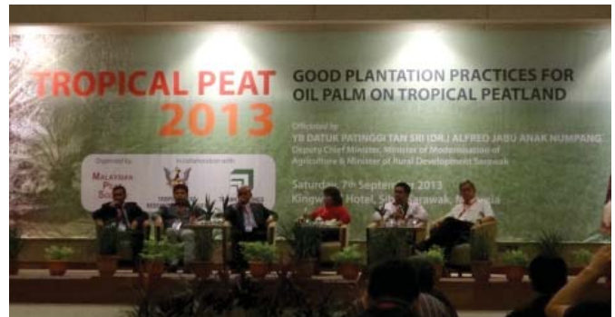
Photo: Speakers during the Question and Answer session