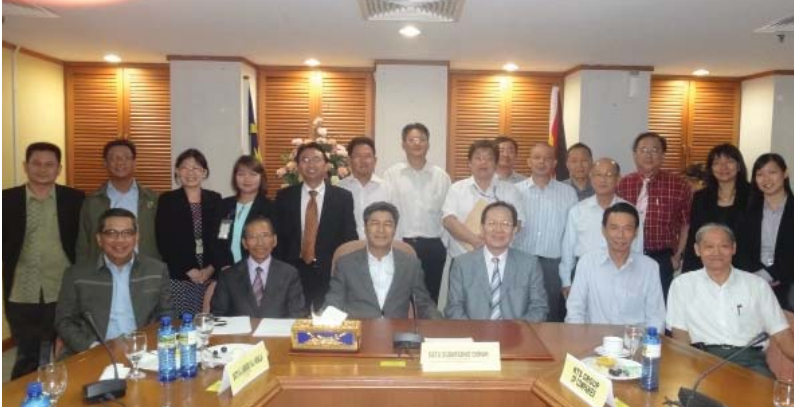
Photo: Group photo