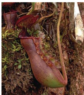
Nepenthes lowii (lower pitch) Habitat: Mossy montane forests