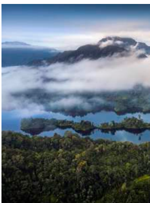
Location: Bengoh Dam, Padawan