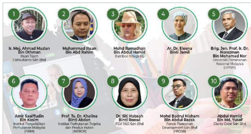
Lineup of speakers for the webinar series

配合 2021 年马来西亚世界竹日，马来西亚木材工业局 (MTIB) 于 2021 年 9 月 28 日至 29 日举办一系列线上研讨会，以促进马来西亚竹制品的发展，并提高竹子作为可持续建筑材料的认可。