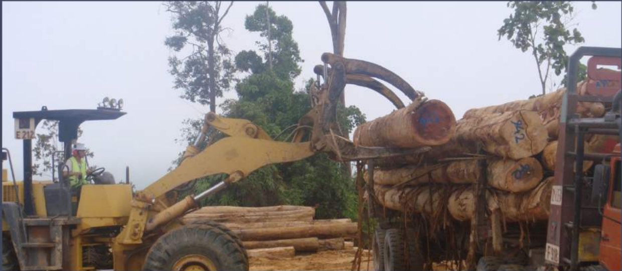
Skills set: Log Loading – Front End Loader (Natural Forest), Activity: Loading Log Onto Log Truck At The Landing Site

The session is designed with the aim to strengthen knowledge and upsurge teaching efficacy among existing in-house trainers who will be training their operators on various forestry activities specifically tree felling, log extraction, log loading, etc. It is initiated as a coaching-mentoring session to provide guidance and opportunities to develop and hone specific skills sets that are essential to being a proficient and confident in-house trainer.