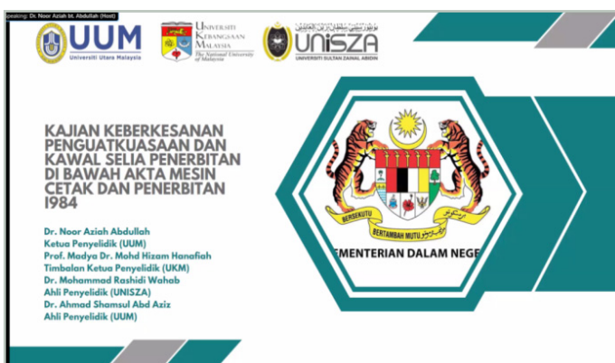
Webinar in session

The Ministry of Home Affairs (MOHA) has appointed a team of researchers from Universiti Utara Malaysia (UUM) to study the effectiveness of enforcement and regulation of publication under the Printing Presses and Publishing Act 1984 (AMCP) which governs the usage of printing presses and the printing, importation, production, reproduction, publishing and distribution of publications in Malaysia.