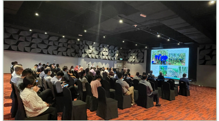
Debriefing session in progress.

These trips to other markets around the world helped the timber industry to understand the current situation, market sentiments, country policies and directions as well as possible business opportunities such as venturing in overseas markets.