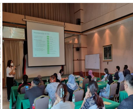
(First and Second Photo) Students exploring some of the exhibits at the Exhibition Centre; (Third Photo) Briefing in progress

本会于2022年11月25日接待和欢迎一组23名来自马来西亚砂拉越大学 (UNIMAS) 资源科学与技术学院, 正在就读木材科学与保护技术课程最后一年的大学生。