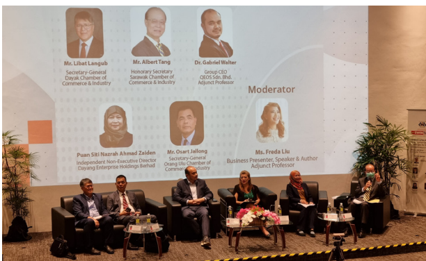
Panel discussion in progress

Bursa Carbon Exchange, dengan kerjasama Control Union Malaysia and Macquarie Bank Limited menganjurkan webinar pada 16 Mei 2023 untuk berkongsi pandangan mereka dengan syarikat berhubung peningkatan aspek alam sekitar dalam rangka kerja persekitaran, sosial dan amalan tadbir urus, dengan matlamat utama untuk mencapai pelepasan sifar bersih.