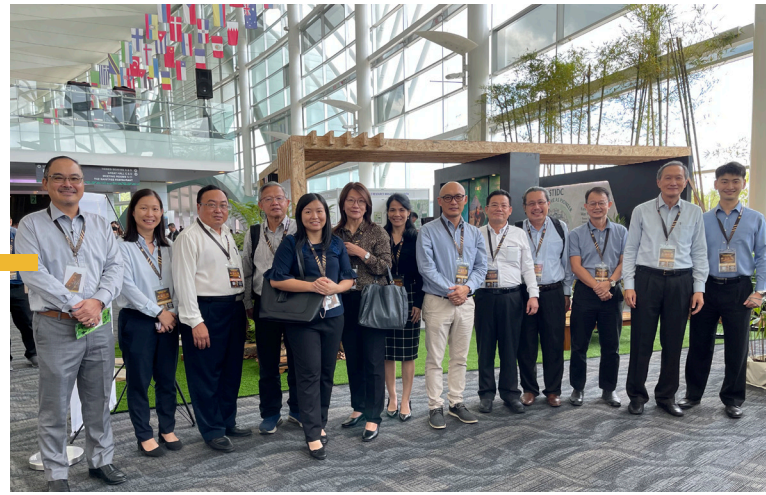
STA delegation at the conference

The event served as a platform to share best practices information, know-how and requirements in engineered wood industry; develop market for engineered wood