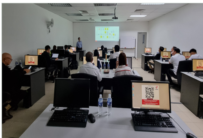
Lab in progress

The lab was attended by officers from FDS, SAINS, STA and STA Training Sdn Bhd (STAT). During the review session, SAINS presented the process flows for training and assessment nominations of forest workmen as well as data integration between STAT database and the Forest Licensee Portal. Additional inputs were received from participants for the enhancement of the system.