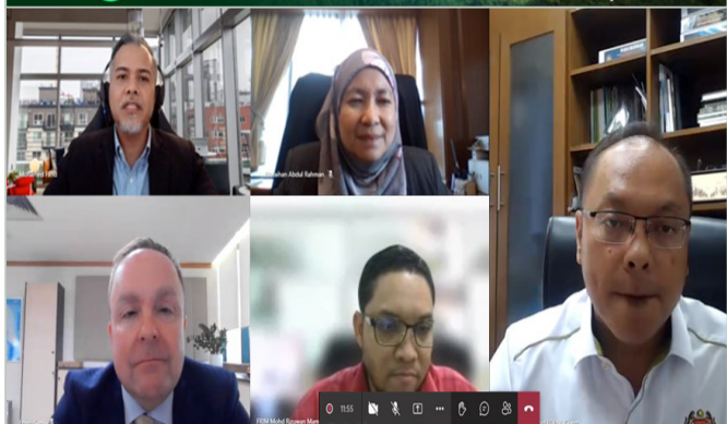
Webinar in progress