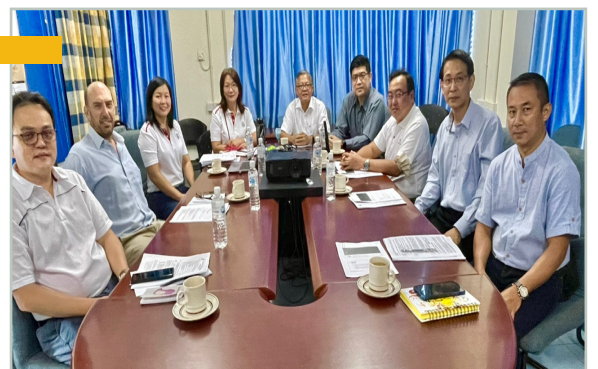
Group photo taken before commencing the Committee meeting.

The Committee also evaluated three (3) progress reports submitted for Phase 3 of the Falcataria moluccana Research Project.