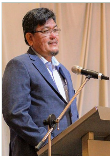
Opening Speech by the Director of DOSH Sarawak.

He also encouraged participants to implement a systematic approach on OSH risk management at their workplaces so that the OSHMP25 can be fully achieved by 2025.