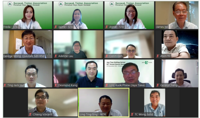
Meeting in progress.

STA原木行销小组于2023年2月8日召开线上会议。会议选出2022年和2023年的新委员会成员，同时也分享和商讨原木统计、印度买家要求与砂拉越原木出口商直接交易以及从2023年8月5日起生效的日本要求进口植物和植物产品的植物检疫证书等事项。