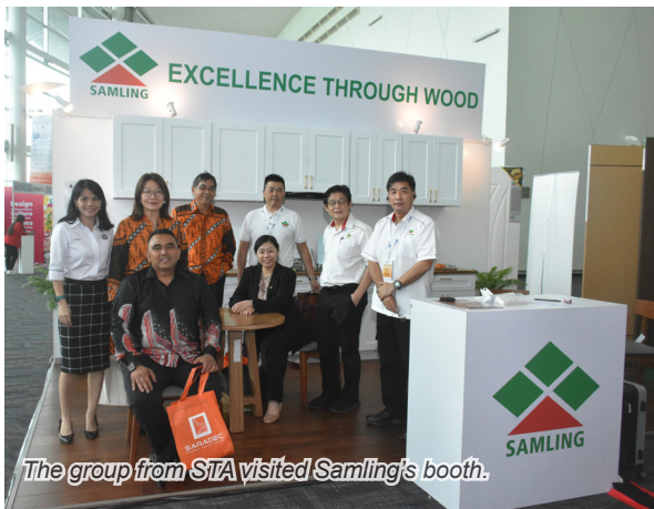
The group from STA visited Samling’s booth.

The inaugural event with theme “Design for Tomorrow” aimed to showcase and exhibit creative designs by SayD’signersSarawak as well as to create awareness and inculcate interest on the importance of design among the furniture industry players and society in Sarawak. Approximately 200 booths were set up to display