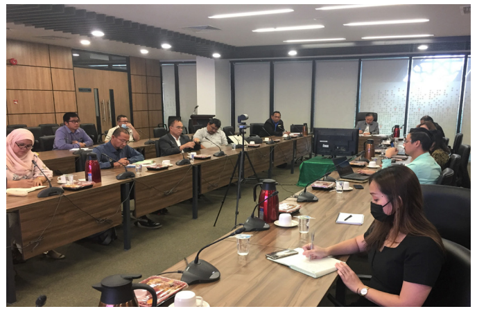
Sharing Session by LESTARI-UKM.