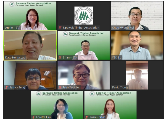
STA Training Sdn Bhd Board of Directors Meeting.

The BOD of all the subsidiary companies approved the audited financial statements for the year ending 31 December 2022 and the amendments to the Memorandum and Articles of Association (M&A) of the respective subsidiary companies. The amendments to the M&A were made to incorporate STA Council's decision on routine expenditure, to update to Companies Act 2016 and to be consistent with STA Constitution as well as to correct any typographical or grammatical errors.