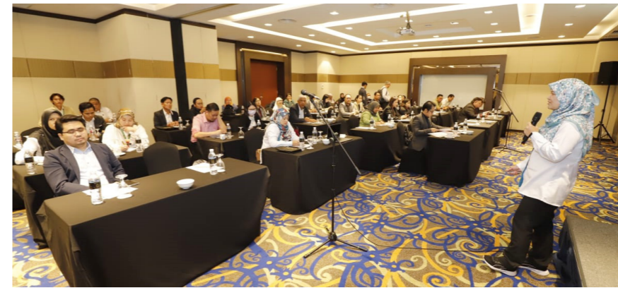
Seminar in progress.

He concurred that the establishment of a joint committee with UNIMAS would be prudent to delve into the various stages of the product value chain to understand the