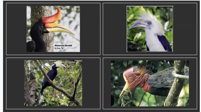
Helmeted hornbill ( Rhinoplax Vigil ) (bottom right) and other types of hornbill.