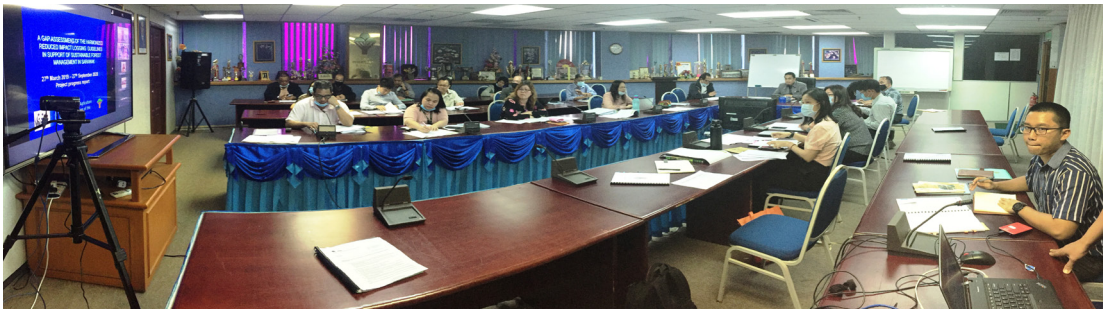
Photo: Meeting in progress

The Meeting agreed for stakeholders to feedback on the Draft Guidelines which STA will discuss with members and submit comments in early July.