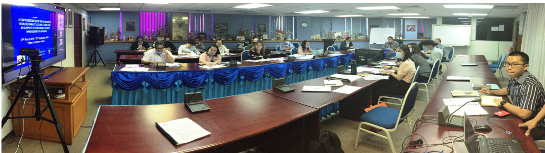
Photo: Meeting in progress

The Meeting agreed for stakeholders to feedback on the Draft Guidelines which STA will discuss with members and submit comments in early July.