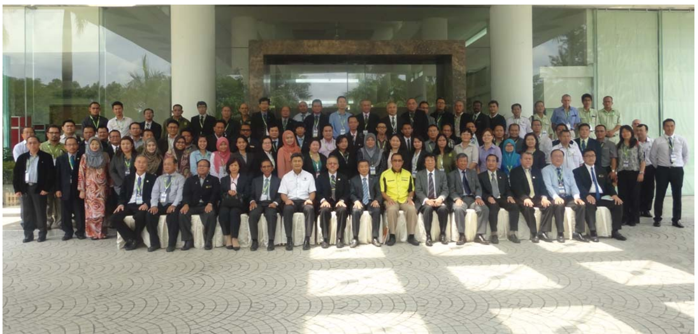
Photo: Group Photo

In terms of research and development support to improve the quality of the planting material, he said the Government would help the tree plantation development through SFC. The Ministry of Resource Planning and Environment has commissioned SFC to address the reported shortage of high-quality planting materials. SFC is assigned to fast-