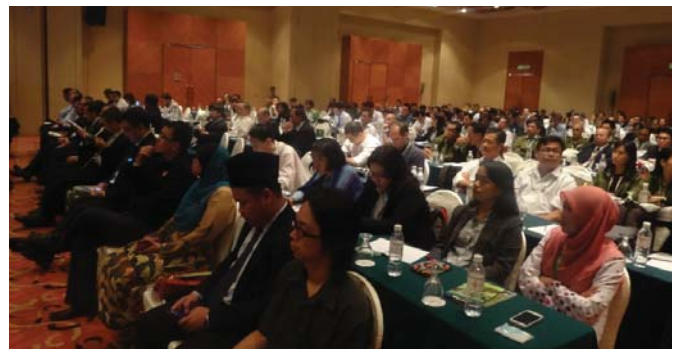
Photo: Participants at the Conference

He also wanted to see the licencees and the relevant agencies such as FDS, SFC and Land & Survey Department working together to resolve issues especially those relating to land matters.