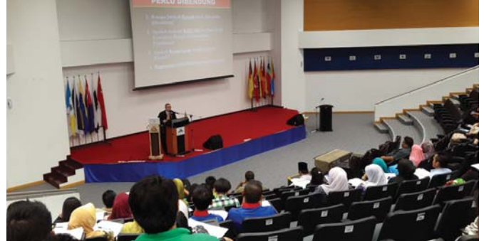
Photo: Seminar in Progress

A Seminar on Excellence in Ethical Business 2014 was organised by the Ministry of Domestic Trade, Co-Operatives and Consumerism (KPDNKK) on 14 October 2014 at the Malaysian Tax Academy, Kuching. The seminar was aimed at hawkers and small traders to understand the integrity in business practices and importance of ethics in business.