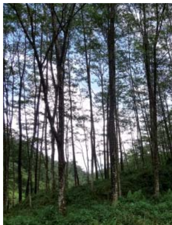
7-year old Paraserianthes falcataria plantation in Sarawak