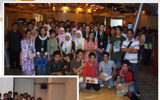
Right: The first group of students from Twintech College at the STA Exhibition Centre