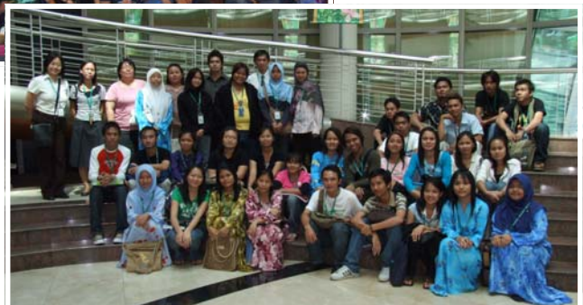
Right: The third group of students from Twintech College