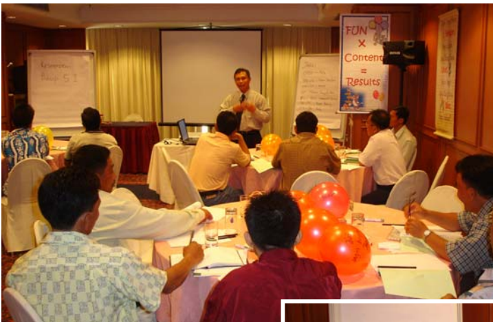
Left: STA Trainer giving lecture to the candidates

STA Training Sdn Bhd (STAT) telah mengadakan Kursus Melatih Pelatih ke-6 dari 18 hingga 21 Oktober 2007 di SibU. Kursus ini bertujuan untuk mempertingkatkan pengetahuan pelatih, kemahiran dan kebolehan dalam memberi latihan kepada pelajar dewasa di tempat kerja masing-masing. Ia juga bertujuan untuk menolong ahli STA dalam melatih tenaga kerja mahir yang akan memanfaatkan majikan dan pekerja.