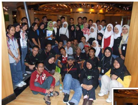
Left: Students from Universiti Putra Malaysia, Bintulu Campus

The students were briefed on the outlook of the timber industry of the State as well as the roles and responsibilities of STA. They were also taken on a tour around the STA Exhibition Centre. ⚙