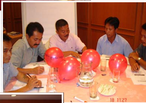
Right: Candidates having a discussion