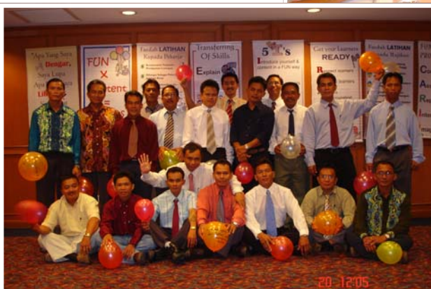
Left: Group photo of the candidates attending the course