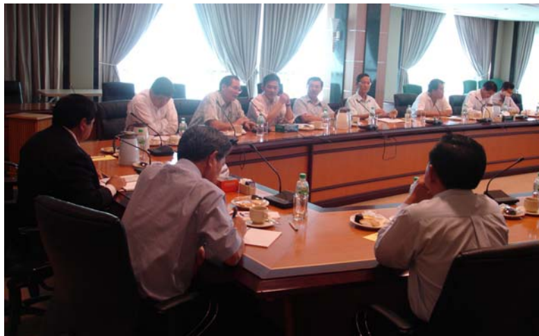
Left: Meeting in progress

In the meeting, it was decided that the rates remained unchanged due to the present unfavourable market situation. The meeting resolved that the logging road usage charges: (1) road toll at RM0.20 per mile per Hoppus ton and (2) maintenance fee at RM0.20 per mile per Hoppus ton will remain status quo. However, these charges will be reviewed again in six months' time. ❁