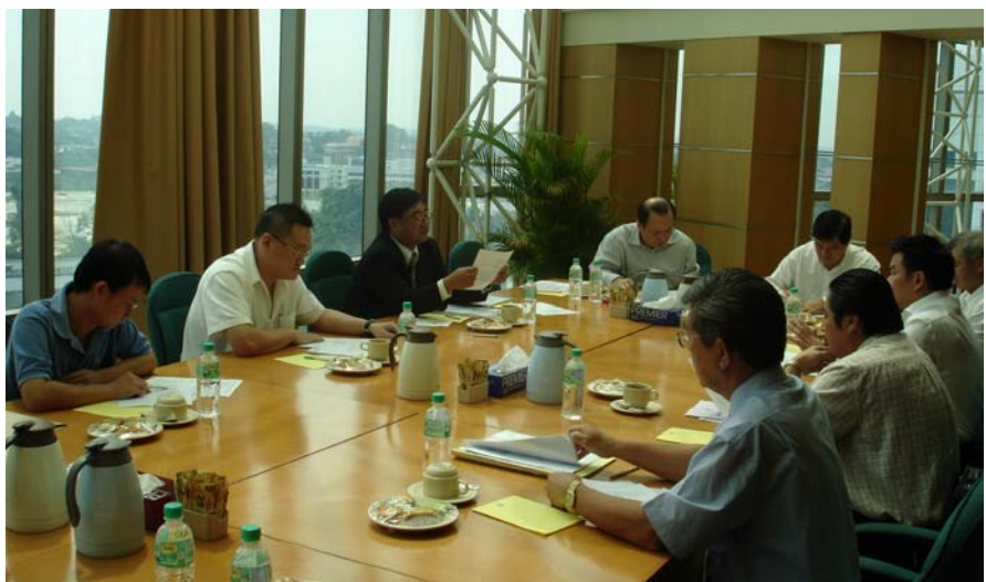
Picture: Members exchanging market reports