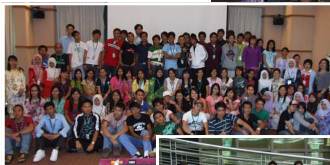
Left: The second group of students from Twintech College