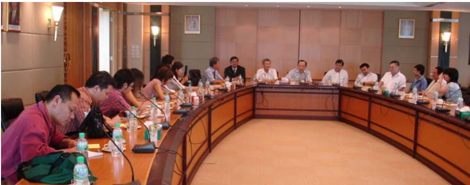
Picture: Meeting with Members of the Press

the voluntary reduction in the plywood production by the Members of the Panel Products. For the month of October 2007, Members agreed to reduce production by 20-25%. ❁