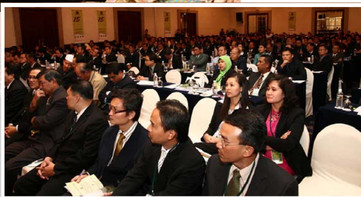
Right: Participants at the Conference