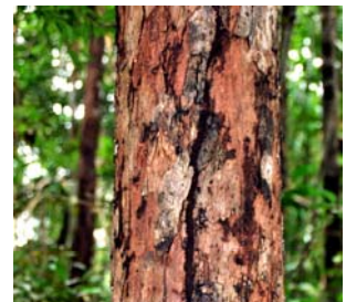
Right: Sempilor bark