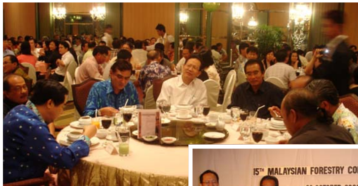
Left: Guests enjoying themselves

The event marked the end of the 4-day Conference that was not only filled with presentation of various topics but also sport competitions to foster closer ties between the personnels of the Forest Department of the three regions. The evening was fun-filled with karaoke singing competition and games, performances by participants of the three regions and presentations of prizes to the winners for the golf, bowling, futsal and badminton competitions that were organised during the Conference. ❁