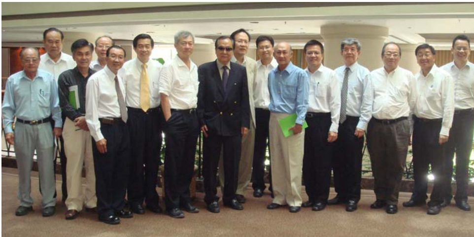
Above: Representatives from the Sabah forest management unit licensees, STIA, TAS and STA

Wakil dari Pemegang lesen Unit Pengurusan Hutan Sabah, STIA, TAS dan STA telah berdialog pada 23 Oktober 2009 di Kota Kinabalu, Sabah. Tujuan dialog adalah untuk membincangkan isu-isu berkaitan dengan rundingan "Malaysia-European Union (EU) FLEGT-VPA". Satu penyata bersama telah dikeluarkan selepas dialog ini.