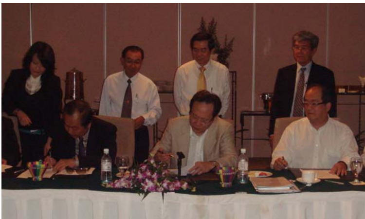
Left: Signing of the Joint Statement by STIA, TAS and STA