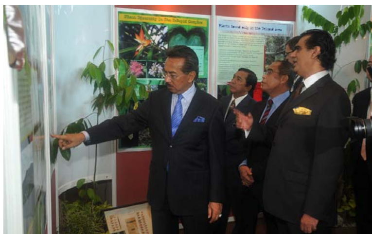
The Chief Minister of Sabah, Datuk Seri Panglima Musa Haji Aman, looking at some of the exhibits at the exhibition put up in conjunction with the Regional Forum

Note: Papers presented are available upon request from the STA Secretariat.