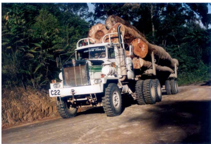
Truck transporting logs

The implementation date of the Harwood Transportation Passes will be 1 January 2010 . ❁