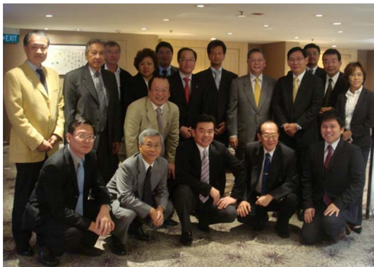
Left: One for the album, representatives from JLIA, JPMA, APKINDO, MPMA and STA

The next Meeting is proposed to be held in April 2010. ❁