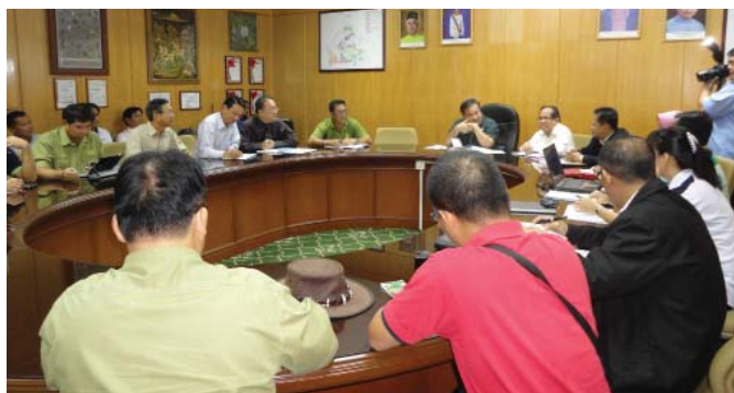
Photo: Meeting in progress