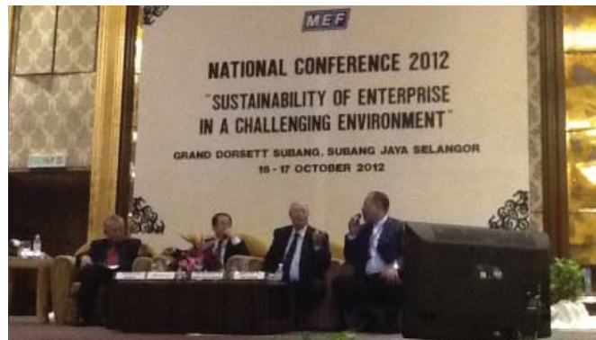
Photo: Panel discussion in progress

The panel shared views on the current scenario on increasing cost of doing business from the plantation industry, SMI and overall employer's perspective. The speakers also highlighted the various types of costs peculiar to their industries. Among others, the speakers shared the way forward to ensure sustainability is to increase productivity, review of labour laws to allow more flexibility in managing human resources such as more flexible working hours, days, etc. and to be innovative through more efforts in research and development, branding, automation and human capital development such as skill certification. There were also calls to review corporate tax because with the increase in operation costs due to increase in labour costs, raw materials, utilities, fuels, transportation, etc. the current 25% corporate tax is very challenging for Malaysia.