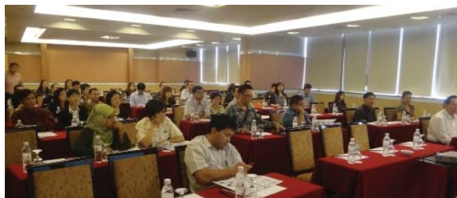
Photo: Training session in Bintulu

Participants also took the opportunity to raise questions to clear their doubts and issues for the speakers to look into. Some of the issues highlighted by the participants relate to the blocked input taxes on passenger cars, entertainment expenses and club subscription fees; control over subsidiary companies for group registration and export of logs through marketing agents.