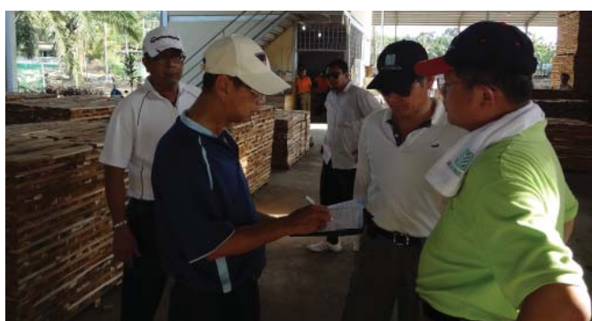
Photo: Small plantation logs processing mill

A delegation of fifteen (15) members comprising representatives from Forest Department Sarawak (FDS), Sarawak Forestry Corporation (SFC), Sarawak Timber Industry Development Corporation (STIDC), Harwood Timber Sdn Bhd, the Forest Plantation category of Sarawak Timber Association (STA) and the STA Secretariat visited the Sabah Forestry Department (SFD) and a few forest plantation sites from 8 to 13 October 2012. The visit, hosted by SFD, was aimed at understanding the role of the Department in the forest plantation industry, as well as the operating procedures and equipment used for the harvesting and movement of plantation logs, including cess assessment procedures.