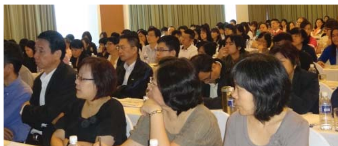
Photo: Training session in Sibu