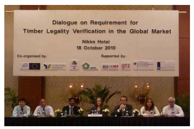
Picture: (above) The presenters answering questions from the participants and (right) some of the exhibitors in the MTC Global Woodmart