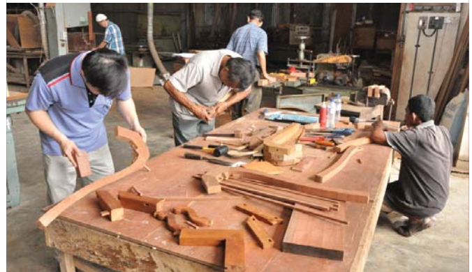
Photo: The carpenters working on their project