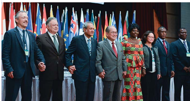
Photo: Group photo taken after the Opening Ceremony of 51 st ITTC

The Annual Market Discussion organised by the ITTO Trade Advisory Group (TAG) was held on 18 November 2015 with the theme "Raising the Profile of Tropical Timber in the Market Place". Five (5) presentations and a report on "Strengthening of the participation of the private sector in advancing ITTO's objectives" were presented at the Annual Market Discussion. Two (2) side-events were held