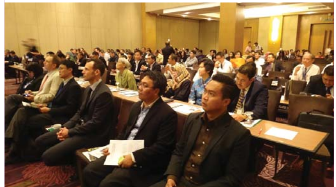
Photo: Participants at the Workshop

Participants of the Workshop were also informed on the implementation of possible sustainable finance options for conservation and sustainable development projects.