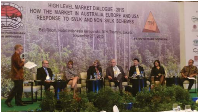
Photo: One of the panellist session during the Dialogue

The High Level Market Dialogue (HLMD) entitled “How the market in Australia, Europe and USA Response to Timber Legality Assurance System (SVLK) and Non-SVLK Schemes” was held on 23 November 2015 at Hotel Indonesia Kempinski, Jakarta. The Dialogue, hosted by the Indonesian Exporters Association (GPEI) in collaboration with PT Mutu Hijau Indonesia was attended by about 200 people.