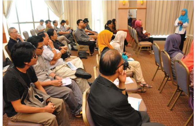
Photo: Participants at the Talk