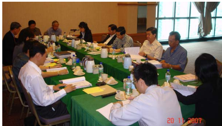
Picture: Meeting in progress

deliberated on the financial matters of the Association and its three wholly-owned companies, STA Training Sdn Bhd (STAT), STA Mutual Sdn Bhd (STAM) and STA Enterprises Sdn Bhd (STAE) . ❁