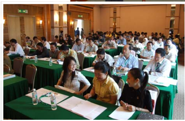
Left: Participants at the seminar

Sarawak Forestry Corporation menganjurkan Seminar Penyelidikan Sains Perhutanan Gunaan dari 1 hingga 2 November 2007, siri ke-tiga, bertemakan 'Catalysing Planted Forest Development and Biodiversity Conservation' di Wisma STA, Kuching.