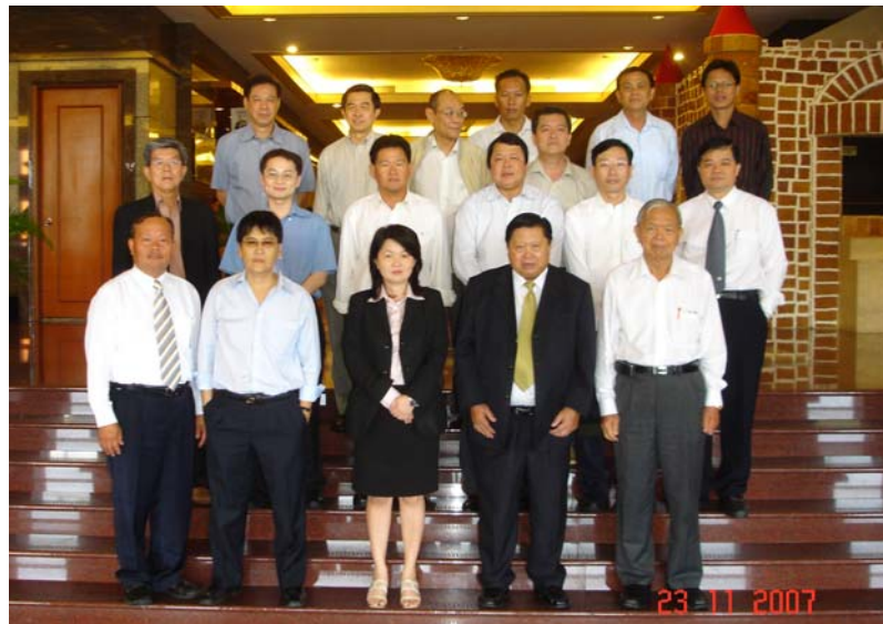
Picture: Group photo of STA Council Members at the 62 nd Council Meeting