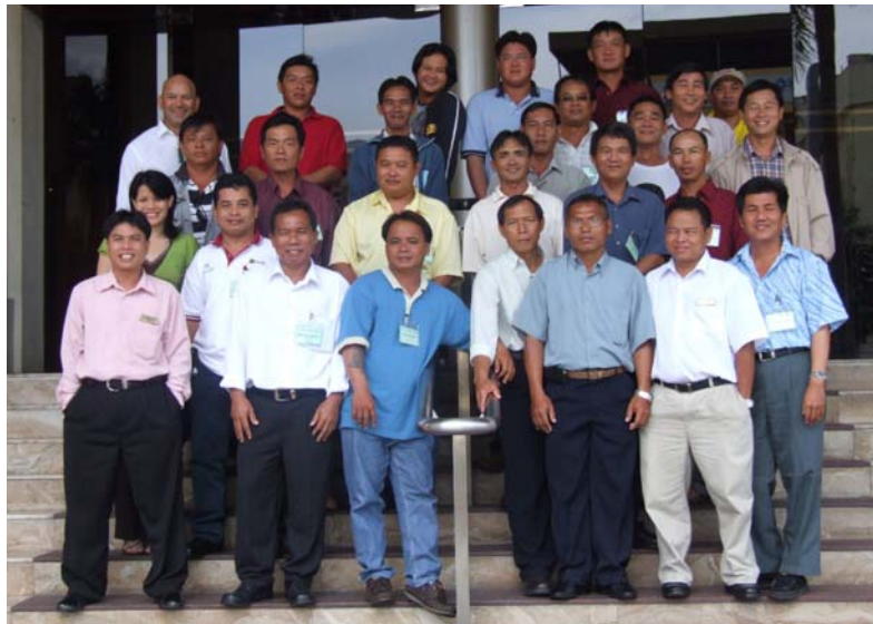
Left: Group photo of trainers with the trainees

STAT received confirmation in writing from the Trainers that their operators are competent in Log loading and the relevant documentation has been completed, then STAT Assessors will proceed with the onsite assessment. ❁