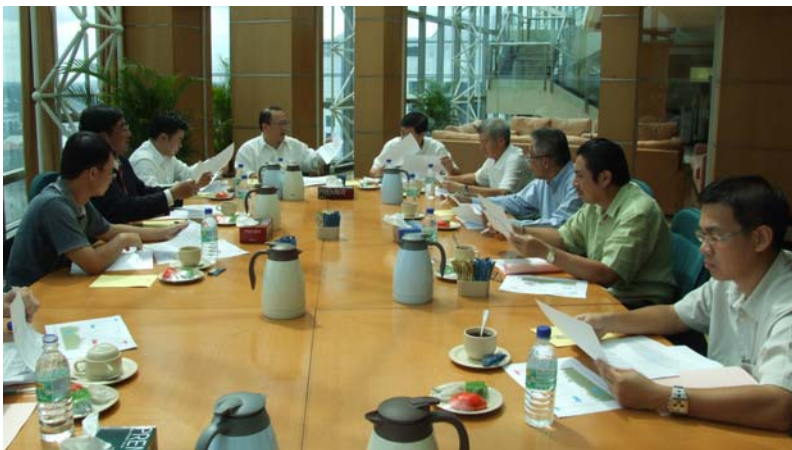
Left: Members of the Committee exchanging market information

The Committee also deliberated on the Committee's Annual Budget for 2008. ❁