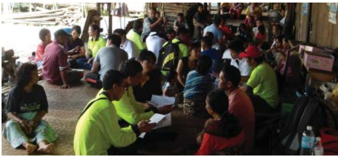
Photo: Interview session in progress with the villagers of Kampung Simuti

The subject on Communities and the Forest Industry of the Postgraduate Diploma in Applied Science (Sustainable Tropical Forest Management) (PGDip) Course was held from 18 to 22 November 2013 at Wisma STA, Kuching. The subject covered Non-timber Forest Products (NTFP), Sociology of Communities, Social Impact Assessment (SIA) and Conflict Resolution. The aim of this subject is to understand and analyse issues related to community forests as well as to resolve conflicts.