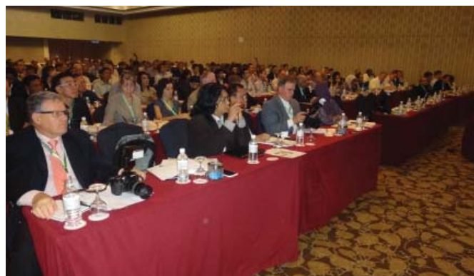
Photo: Dialogue in progress

Penganjur juga menganjurkan acara sampingan semasa Dialog seperti yang disenaraikan dalam artikel ini bagi membolehkan perbincangan lebih mendalam antara kalangan peserta.