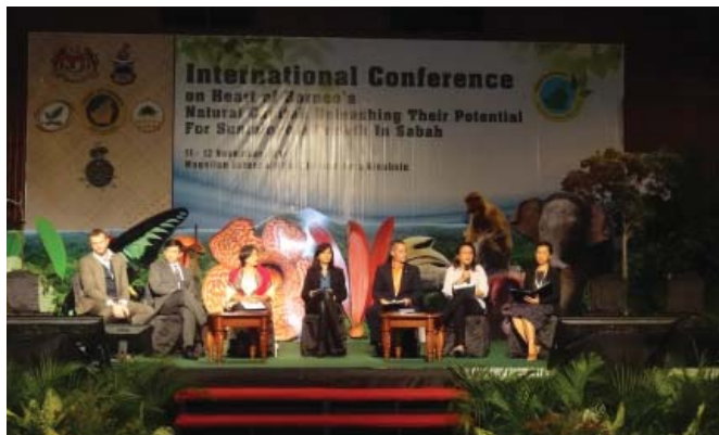
Photo: Sharing Session on Forever Sabah Solutions

Jabatan Perhutanan Sabah (SFD) telah menganjurkan Persidangan Antarabangsa yang ke-5 mengenai "Heart of Borneo's Natural Capital: Unleashing their Potential for Sustainable Growth in Sabah" dari 11-12 November 2013 di Hotel Magellan Sutera, Sutera Harbour Resort, Kota Kinabalu, Sabah.