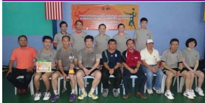
Photo: STA Badminton team represented by staff members from Shin Yang Group of Companies

Sarawak Timber Association (STA) participated in a badminton tournament organised in conjunction with the 40 th anniversary of Sarawak Timber Industry Development Corporation (STIDC) on 2 and 3 November 2013 at AMPM badminton hall, Miri.