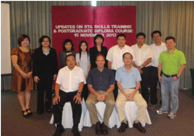
Photo: Participants of the Briefing

STA Training Sdn Bhd (STAT), a wholly-owned subsidiary of Sarawak Timber Association (STA) organised a series of briefings and roadshow in Miri at Grand Palace Hotel, Bintulu at Kemena Hotel and Sibu at RH Hotel on 13, 14 and 15 November 2013 respectively. Participants who attended the briefings and roadshow comprised training coordinators and forest managers.