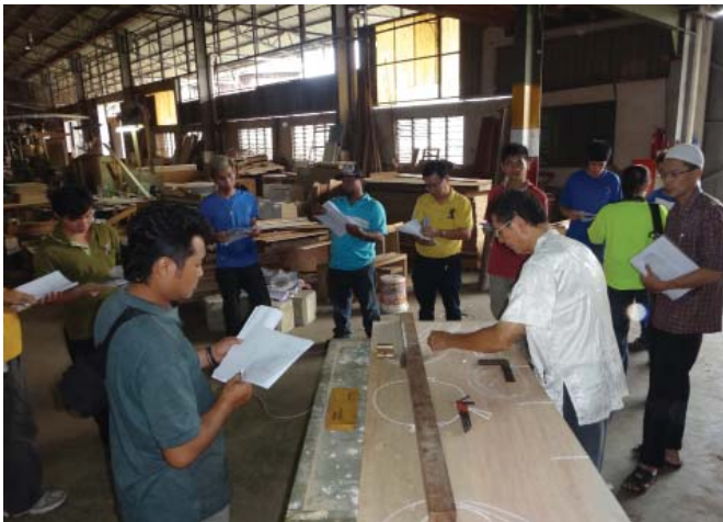
Photo: Hands-on session