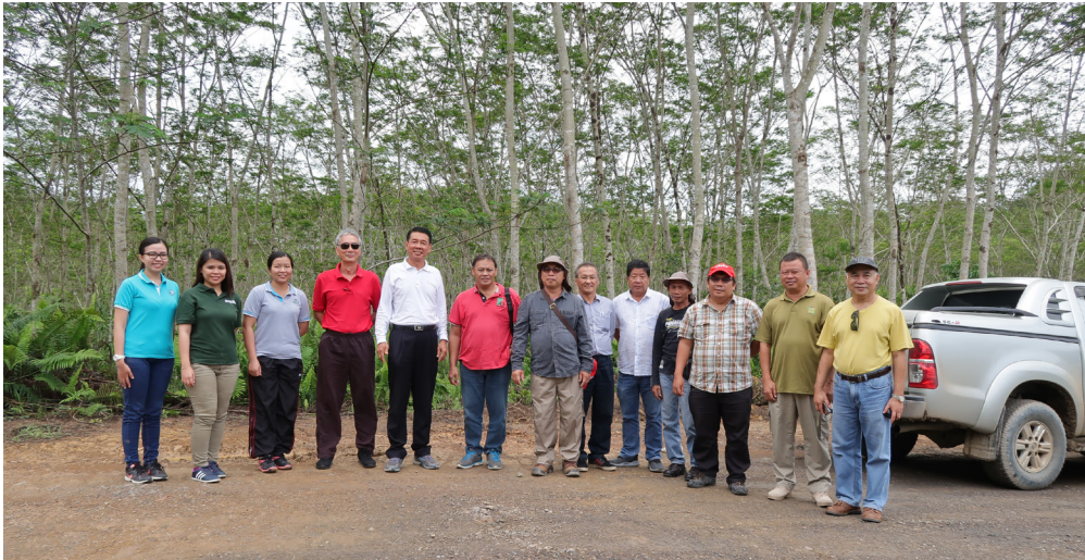
Group photo with representatives of the Study

SARAWAK FORESTRY Corporation (SFC), Forest Department Sarawak (FDS) and Sarawak Timber Association (STA) had commenced the Weight-to-Volume Conversion Factor Study for planted Kelampayan in 2017. The conversion factor derived from this study, with the approval from the Acting Director of Forests, FDS, will be used in royalty and cess assessment of planted Kelampayan.