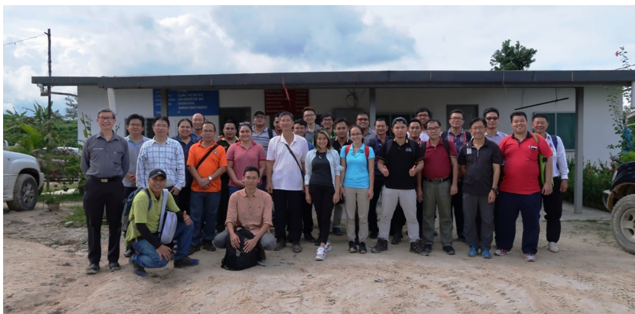
Group photo after completion of site audit

Persatuan Kayu Kayan Sarawak (STA) dengan kerjasama Lembaga Sumber Asli dan Alam Sekitar (NREB) Sarawak telah menganjurkan Kursus Latihan Audit Pematuhan Alam Sekitar 3 (Kursus) khas untuk ahli-ahlinya. Penganjuran Kursus ini merupakan salah satu inisiatif yang diambil oleh STA untuk membantu meningkatkan pembinaan kapasiti ahli-ahlinya dari segi alam sekitar.