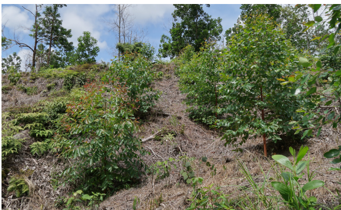
Eucalyptus pellita trial plot at LPF 0014 Segan