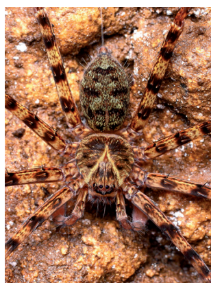
Cave Huntsmant spider