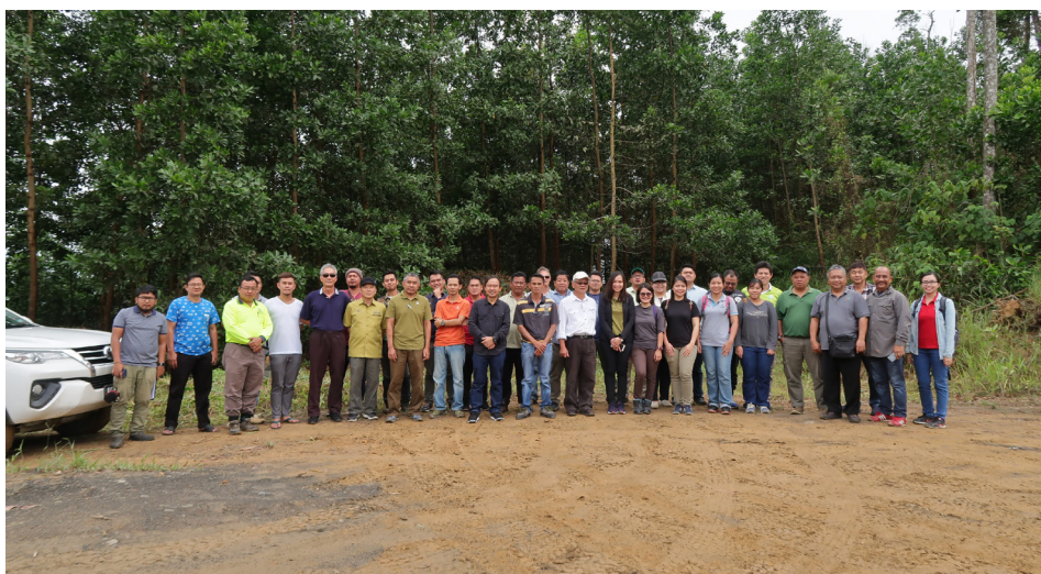
Group photo with participants of the Briefing

由砂州森林局召开，一项关于砂大叶相思树人工林的枝干枯萎病研究汇报及研讨会于2018年5月22日假民都鲁黄金湾（译名）酒店举行。会议由砂州森林局副局长杰克梁先生（译名）主持。