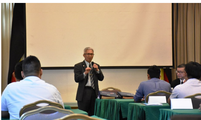
Opening remarks by the Controller of Environmental Quality Sarawak

During the 2 weeks session of training, participants of the Course were taught on environmental laws and regulations as well as key principles of auditing which includes systemic audit process, audit scope, systematic approach during site audit and writing of audit report. The trainer emphasised that ECA is conducted based on the