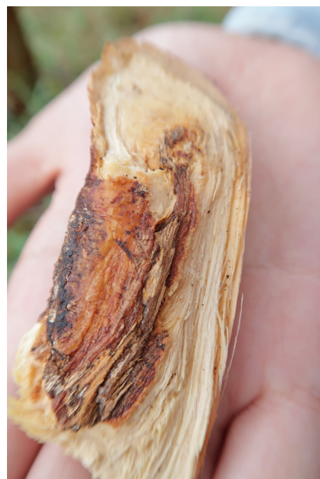
Symptoms of Ceratocystis wilt disease on A. mangium tree