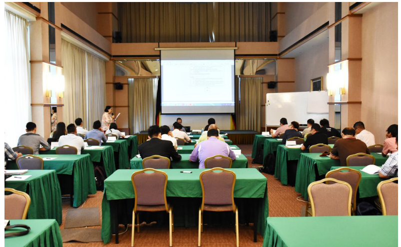
Presentation by NREB's Officer on Environmental Laws and Regulations

Three (3) presentations; namely (i) the Natural Resources and Environment (Audit) Rules, 2008, (ii) the Natural Resources and Environment (Prescribed Activities) Order, 1994, and (iii) the Guidelines for Natural Resources and