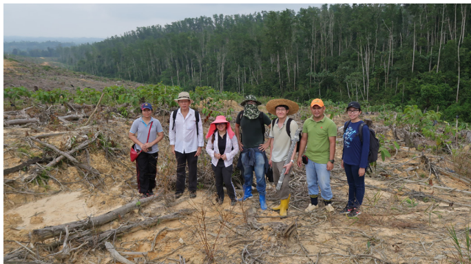
Group photo with representatives from SUTS, Zumida Sdn Bhd and STA Secretariat