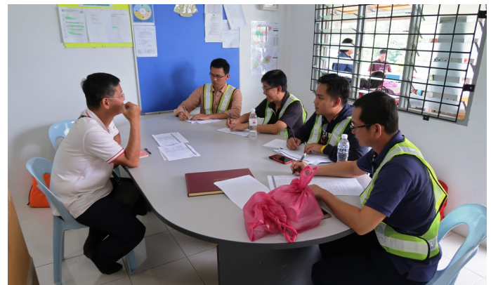
Participants of the Course conducting an interview session during their practical on site audit