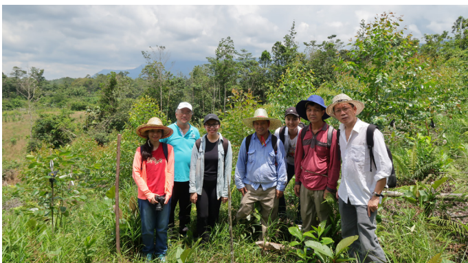
Group photo taken at Sabal Forest Reserve

Tujuan lawatan lapangan adalah untuk mengesahkan prestasi pertumbuhan Neolamarckia cadamba dan benih Eucalyptus pellita di bawah pelbagai jenis rawatan yang telah dilaporkan oleh SUTS sebelum ini.