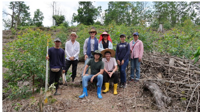
Group photo with representatives from SUTS, Samling Reforestation (Bintulu) Sdn Bhd and STA Secretariat

本会于2015年颁发研究与开发 (R&D) 资金予斯威本技术大学砂拉越分校(SUTS),资助一份“用生态系统方式制定含有促进增长的根际微生物肥料以协助育种黄梁木和粗皮桉树”研究计划。该计划旨在从土壤中鉴定和抽取可用于配制生物肥料以促进黄梁木和粗皮桉树生长的根际微生物,并预计于2018年6月30日完成。