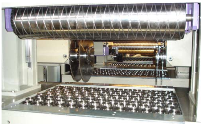
Picture: Inside a Gang Rip Saw with innovative gripping and conveying system

The Ligna Fair catalogue, some information on products, including some CDs on woodworking machines, 3-D thermoforming and research on sawmill systems are now available for viewing at the STA Secretariat. ❁