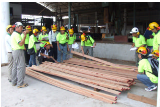
Picture: Measuring sawntimber

To meet the skill needs of managers, the Sarawak Timber Association and Lincoln University in New Zealand, with the cooperation of the Sarawak Forestry Corporation and the Forest Department Sarawak, have developed a Postgraduate Diploma for managers in the logging industry.