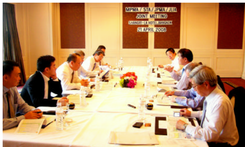
Picture: The Joint Meeting in progress