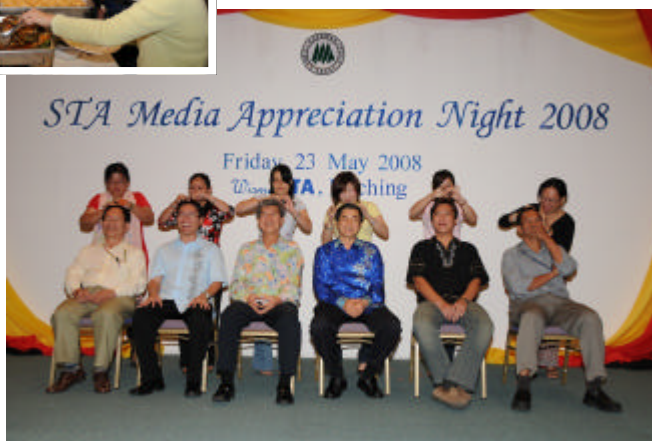
Right: The sporting volunteers participating in one of the many games played during that night