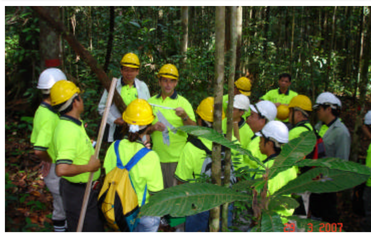
Left: Field work, part of the Course syllabus