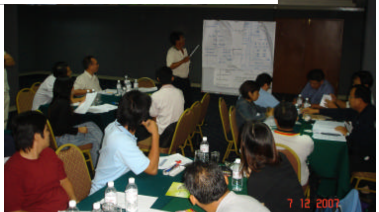
Right: Presentation of field work results in class