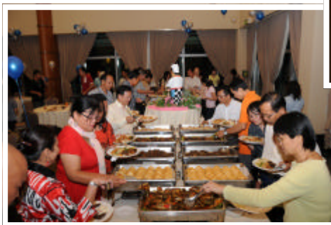
Left: Guests helping themselves to the sumptuous buffet