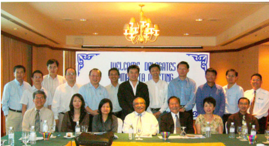
Picture: Participants of the Meeting

Persatuan Pekilang-pekilang Produk Panel Malaysia dan STA telah mengadakan mesyuarat dengan Pengeluar Papan Lapis Sabah pada 12 Mei 2008 di Kota Kinabalu, Sabah.