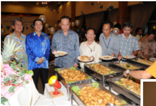
Left: One for the album

Participants were entertained to an evening of games, karaoke sessions and lucky draws. ❁