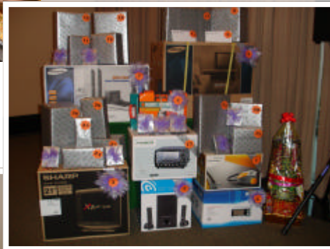
Right: The lucky draw prizes