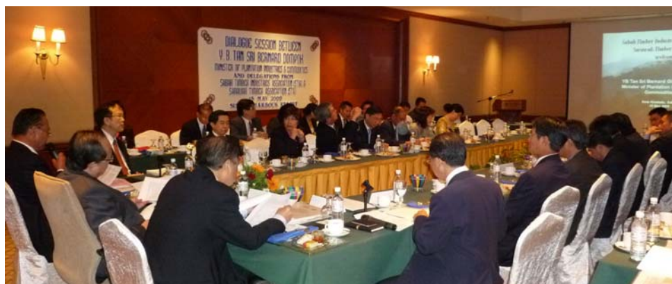
Presentation to the YB Minister