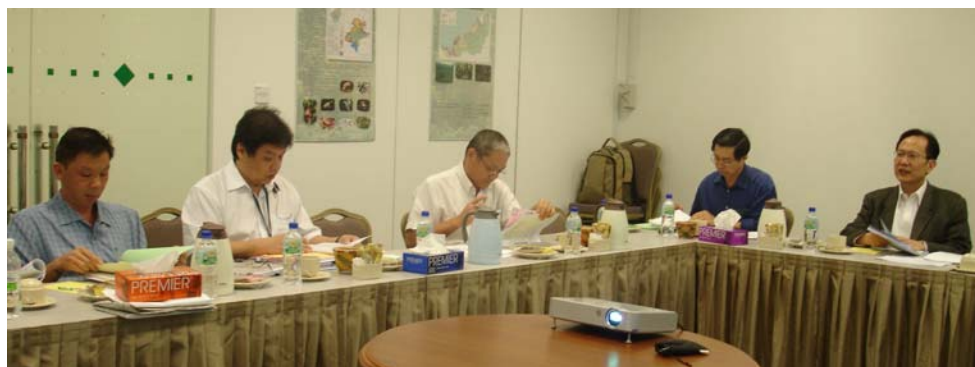
Meeting in session

The Committee met again on 26 May 2009 to review and discuss the MC&I(2002) for Forest Management. The discussion went through each Principle and Criterion as well as the Verifiers for the whole document. On 27 May 2009, the Committee had a meeting cum discussion with the relevant government agencies to discuss the suggestions to be put forward to MTCC for the revision of the MC&I (2002). ❁