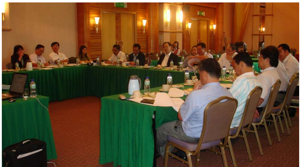
Members of the STA Certification Committee and representatives from Sarawak Forestry Corporation and Forest Department Sarawak at the briefing