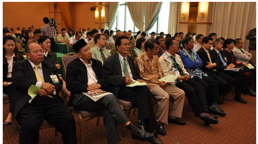
Right: Invited guests and participants at the opening of the Seminar