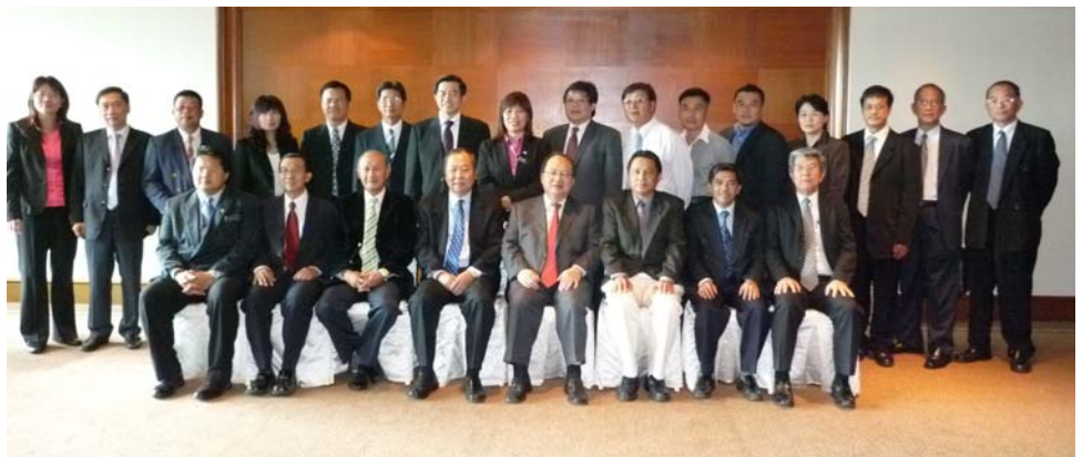
Members from STIA and STA with representatives from the Ministry, MTIB, MTC and MTCC with the Minister of Plantation Industries and Commodities, Y.B. Tan Sri Bernard Giluk Dompok