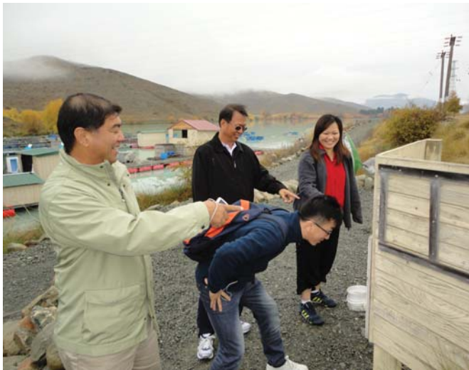
Photo: Field trip to see how plantation wood is utilised.