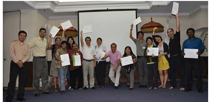
Photo: Participants with their Certificates

RECOFTC – 人民与森林中心(RECOFTC) 于2011年5月24日至27日假印尼，巴厘岛沙努尔天堂广场酒店举办自然资源冲突管理执业高级调解课程。