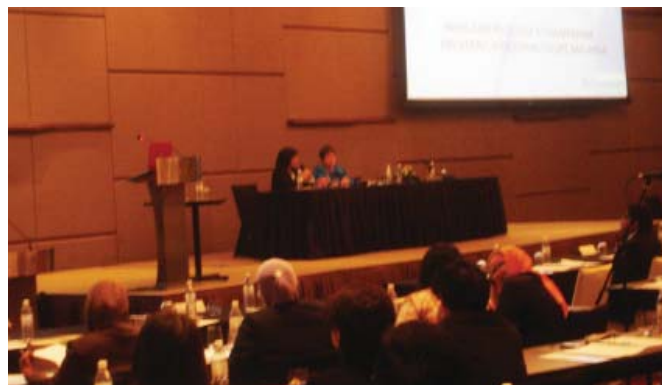
Photo: Conference in Progress

Persidangan Kebangsaan Undang-Undang Pekerjaan 2011 yang ke-7 telah diadakan di Hotel Doubletree, Kuala Lumpur dari 11 hingga 12 Mei 2011.