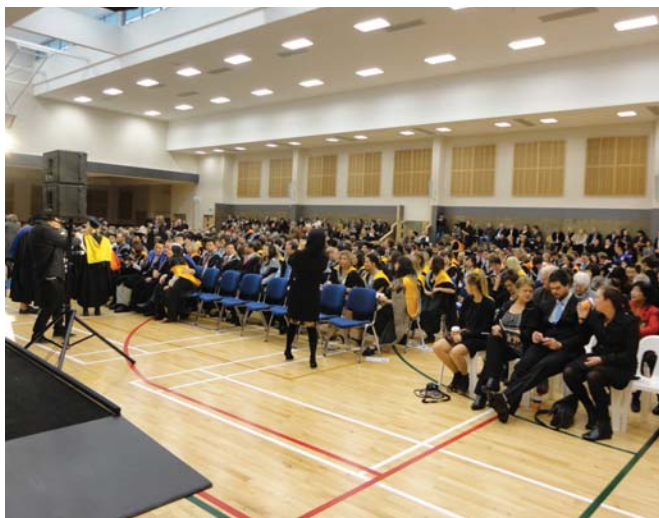
Photo: Graduates at the Graduation Ceremony