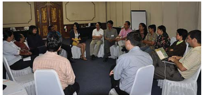
Photo: Group Discussion