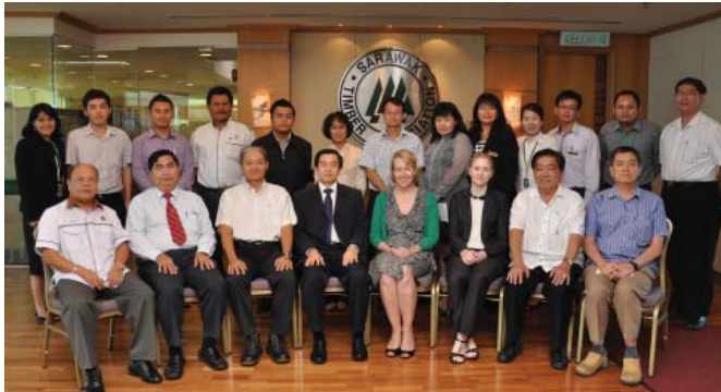
Photo: Group photo