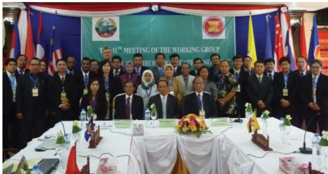
Photo: Group photo

The 11 th Meeting of the Working Group on a Pan ASEAN Timber Certification Initiative was held from 22 to 23 May 2012 in Luang Prabang, Lao People's Democratic Republic (PDR). The Meeting was attended by delegates from Brunei Darussalam, Indonesia, Lao PDR, Malaysia, Myanmar, Thailand, the ASEAN Secretariat and the representative from European Union (EU) FLEGT Asia Programme.