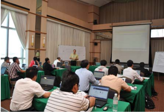
Photo: Class in progress

The Sarawak Timber Association (STA) and Lincoln University of New Zealand, with the assistance from the Forest Department Sarawak (FDS) and the Sarawak Forestry Corporation (SFC) developed a Lincoln University Postgraduate Diploma (PGDip) course for managers working in the logging industry as part of the drive towards building up the capacity of properly trained workforce to better manage the State forests in accordance with the laws and guidelines for sustainable forest management.