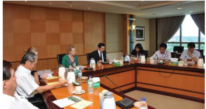
Photo: Briefing in progress

The Sarawak Timber Association (STA) organised a briefing on 'The Draft Australian Illegal Logging Prohibition Bill 2011' on 4 May 2012 at Wisma STA, Kuching. The objective of this Briefing was to present the latest updates on the draft Australian Illegal Logging Prohibition Bill 2011. It was attended by twenty nine (29) participants from various government agencies and STA members.