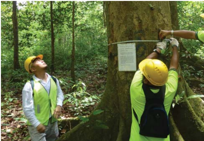
Photo: Students measuring the diameter of a tree