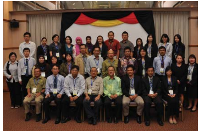
Photo: Group photo

Two books entitled '25 Success Stories Illustrating ITTO's 25-year Quest to Sustain Tropical Forest' and 'ITTO Manual for Project Formulation' were also distributed to participants.