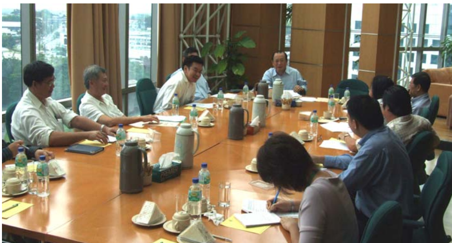
Picture: Meeting in progress

exchanged market information and discussed the current log situation in Sarawak. ❁