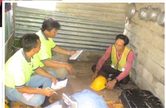
Right: Candidates from the Assessor Workshop having a practical session on workplace assessment