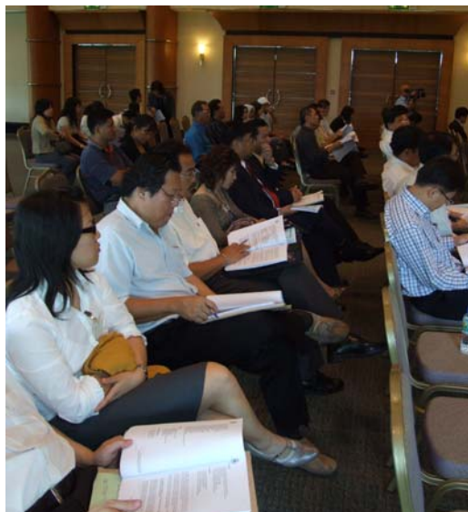
Picture: Representatives from Member Companies at the AGM