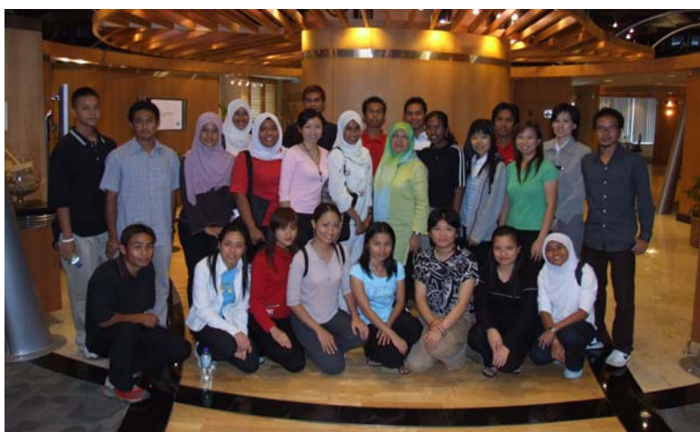
Picture: The students visiting the STA Exhibition Centre