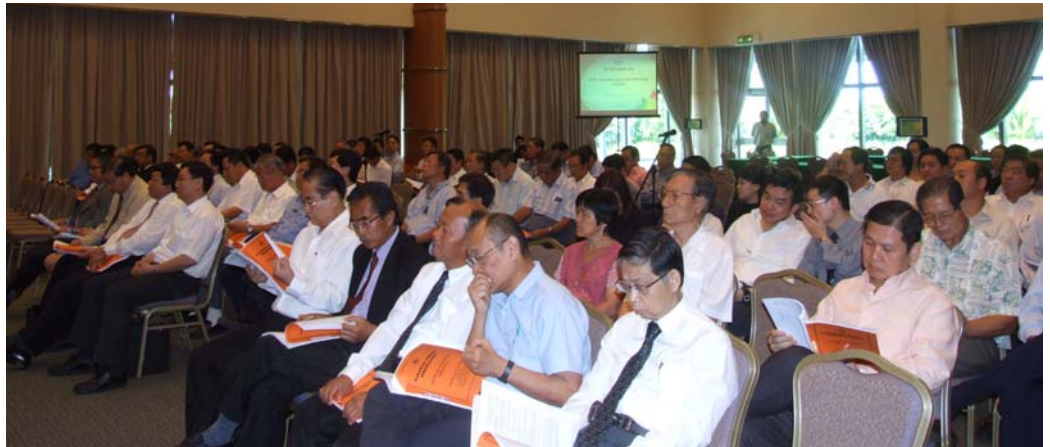
Representatives from STA Member Companies at the meeting