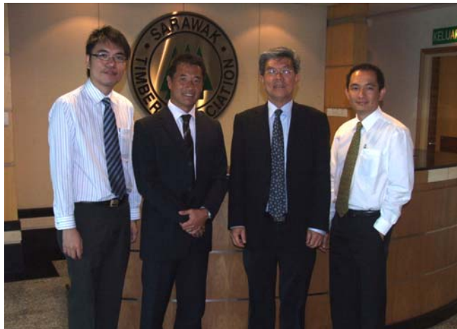
Picture: One for the album

The Bank has been established in Malaysia for 51 years and has an extensive global network in Europe, Middle East and Africa, Asia and Oceania, North America and Latin America. ❁