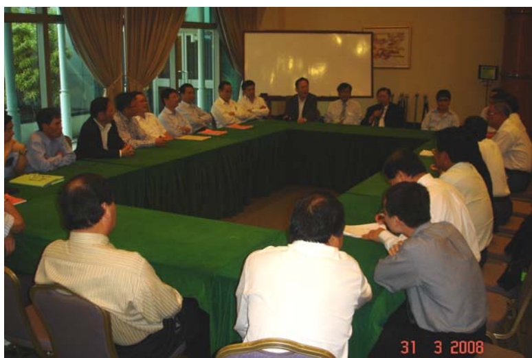
Picture: Newly elected Council Members having a meeting right after the AGM to elect the Office Bearers