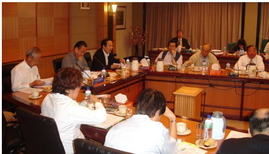
Meeting in progress

Four new membership applications were approved by the Council. ❁