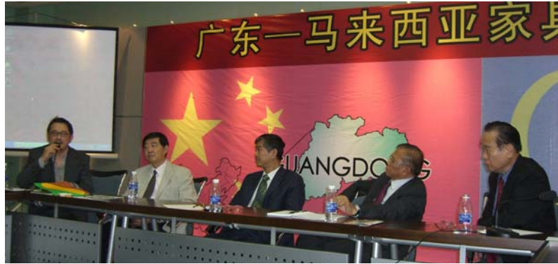
Meeting with the Guangzhou Furniture Association representatives

A dinner was hosted by STA for the delegation of the trip on 21 March 2009. ❁