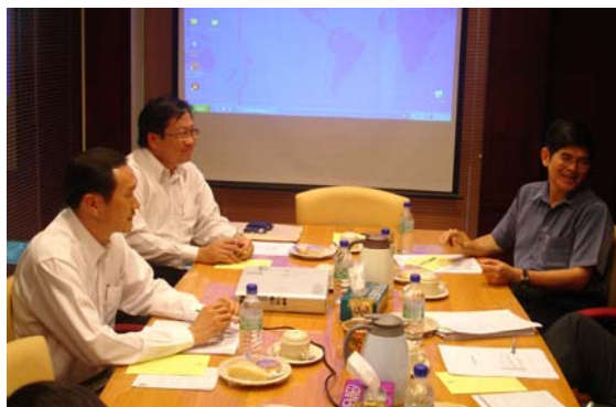
Members having a discussion

Agreement. They discussed extensively on the Lacey Act, a new tool used by the US to help combat illegal logging. ❁