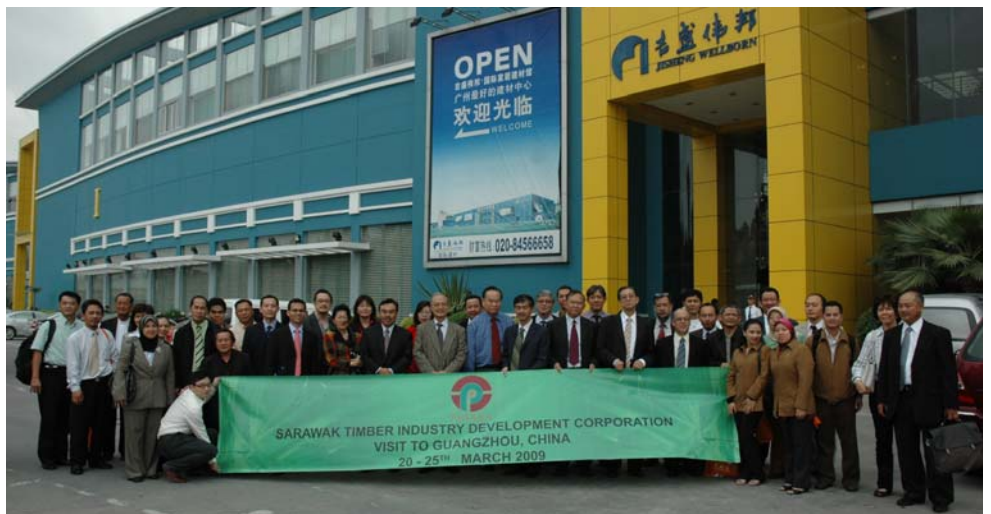
The Sarawak delegation's visit to Sunlink Furniture City, Shunde District