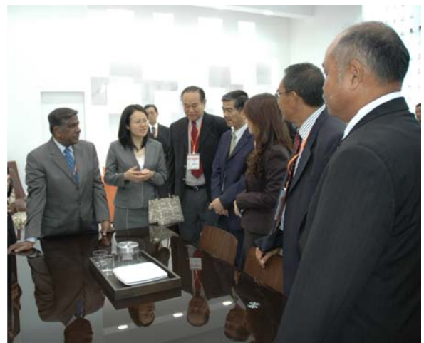
One of the Malaysian booths, HINLIM, at the fair