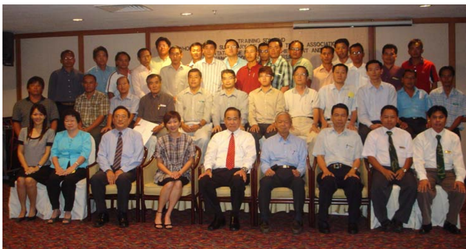
Group photo of successful participants with Chairman of STA, STA Council Members, Manager of STAT and Company representatives

STA Training Sdn Bhd (STAT) 于2009年3月5日假诗巫，金地酒店举办一项证书和拨款赠与典礼。此典礼赠与证书和拨款给已成功完成教练发展和操作员培训课程参与者。