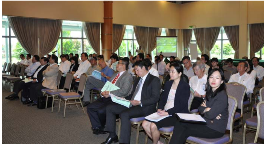
STA Members, observers and invited guests at the Meeting

In 2008 the STA Council approved a financial contribution of RM200,000.00 to the Riam Institute of Technology. This Institute has been training technicians who have been employed by many of our Member Companies. Following the financial contribution this Institute had, at our request launched a Certificate Course in Forest Plantation Practices for Field Supervisors with the course syllabus drawn up jointly with the Forest Department Sarawak, the Sarawak Forestry Corporation and our Association.