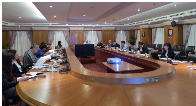
Meeting in progress

Mesyyarat Jawatankuasa Eksekutif Persatuan Kayu Malaysia (MTA) Bil 2/2018 telah diadakan sejurus selepas Mesyyarat Agung Tahunan pada 26 Jun 2018 di Menara PGRM, Kuala Lumpur.