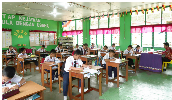
Inside one of the classrooms of SK Ng Encheremin, Kapit with repair works done

Furthermore, STAM works with its members to come up with projects to repair and maintain dilapidated key facilities in schools, especially those located in rural areas. To do this, STA member companies assist in identifying and selecting schools that require assistance. They then carry out the planned works in the schools selected by them with fund support from STAM. To date, this has helped nine (9) primary schools to improve and create a more conducive and safer learning environment for students and teachers alike. The projects that have been carried out include extension of administrative office, construction of school fence, repair works on classrooms and existing community hall, replacement of electrical wiring system for the school building, and also replacement of facilities in classrooms, libraries, and canteens.