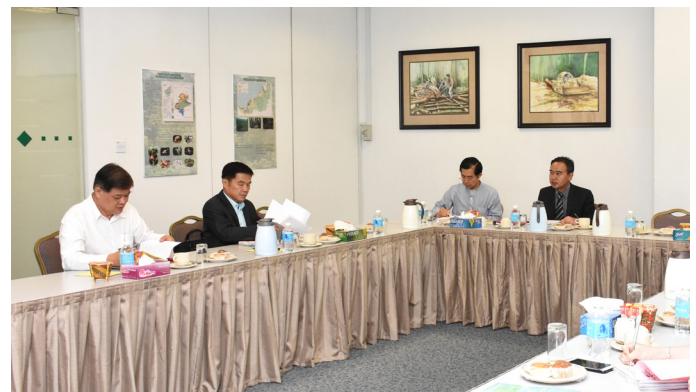
Meeting in progress

本会董事会名誉顾问(BHA)于2018年6月22日假古晋STA大厦召开会议。会议委任砂拉越森林局(FDS)顾问杰克利亚姆先生(译音)为该会议主席。BHA成员在会议中审议众多项目并决议向公司董事会推荐及核准以下决策：