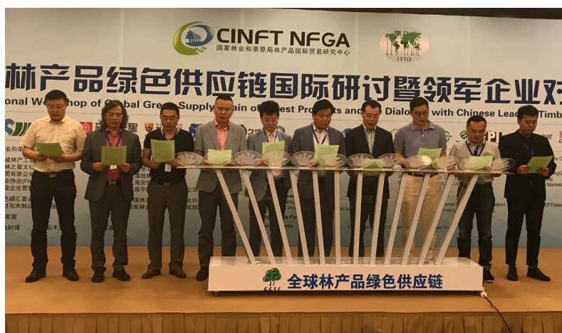
Ten (10) Chinese leading timber enterprises launched an initiative on jointly building the Global Green Supply Chain (GGSC) of forest products

The International Workshop on Global Green Supply Chain of Forest Products and the Dialogue with Chinese Leading Timber Enterprises were held on 21 June 2018 and 22 June 2018 respectively at the Beijing International Convention Centre in Beijing, China. These events were co-organised by the Centre for International Forest Products Trade (CINFT) of National Forestry and Grassland Administration (NFGA) of China and the International Tropical Timber Organization (ITTO).