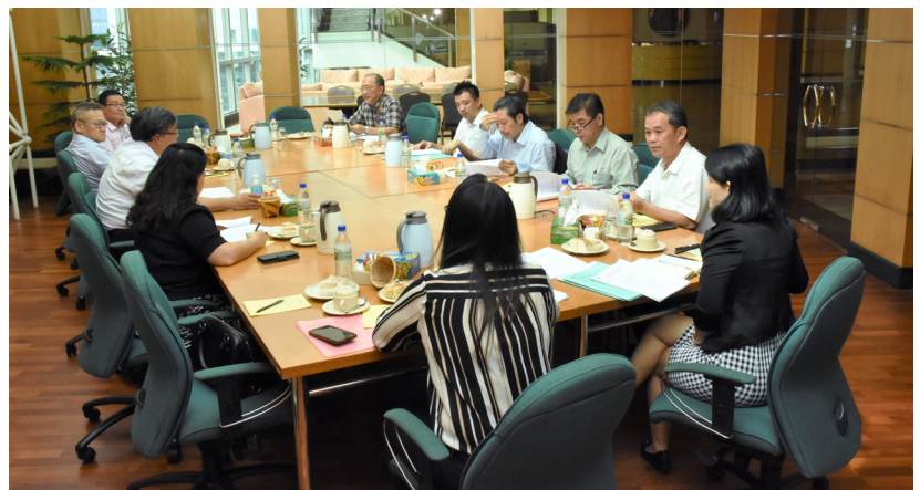
Meeting in progress

After some discussion, the Meeting agreed to a proposal for the same persons to retain the same Office Bearer positions as for the previous term of 2016 & 2017. The Office Bearers and Committee Members together with their alternate members for the term of 2018 & 2019 are listed below:-