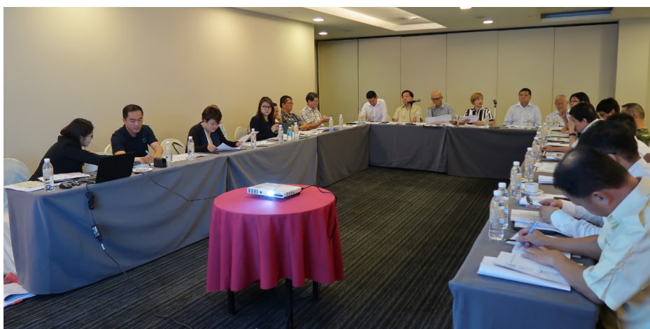
Joint Briefing in progress

A Joint Briefing was also held for all three (3) categories, with the objective to provide a platform for members from the 3 STA downstream categories to discuss and exchange ideas on current timber related issues affecting the industry. A total of 16 members from the 3 respective categories attended the Briefing.