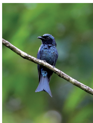
Dicrurus aeneus (Bronze drongo); Photo credit Mr Joanes Unggang, GP Pusaka Sdn Bhd