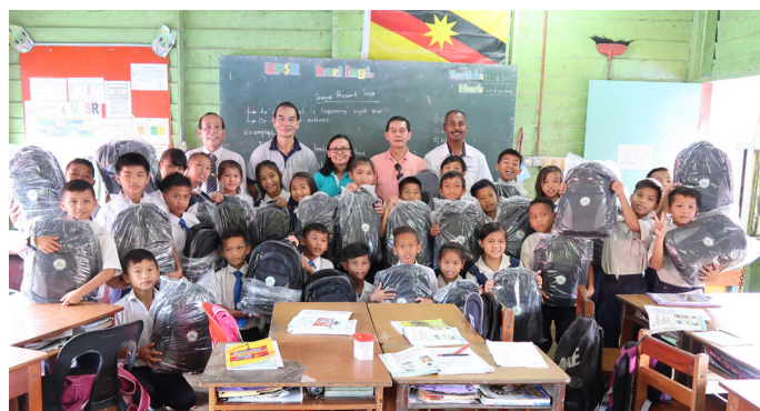
SK Long Luteng, Baram students receiving free school supplies

Apart from monetary aid, STAM teamed up with its members to provide in-kind assistance to Sarawak's rural schools in 2017. With logistics arrangement help from its members, STAM was able to deliver some 1,000 sets of school supplies consisting of school bags and stationeries to a total of twelve (12) primary schools and one (1) pre-school, amounting to approximately RM 86,000.00. The gesture, welcomed by the local communities, was for the purpose of alleviating the financial burden of the families by means of contributing free useful items to the students for their studies.