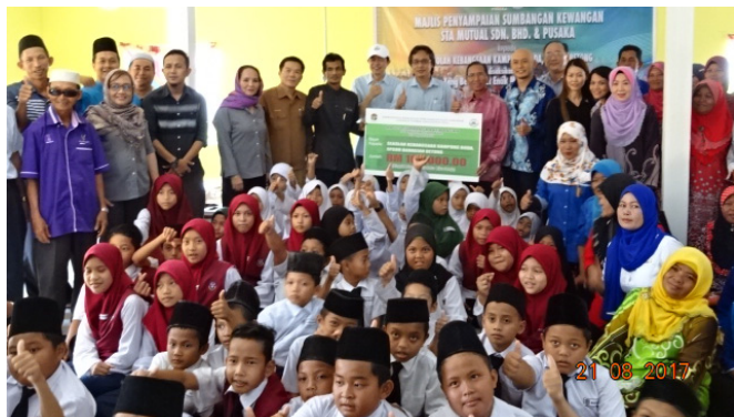
Mock cheque presentation to SK Kampung Buda, Spaoh in August 2017

In June 2016, when SK Kampung Buda in Spaoh, Betong was devastated by a landslide incident, STAM, through STIDC, provided financial assistance to the school. The site where the school was located was declared unsafe, which led to students having no proper classrooms and extracurricular activities were restricted. To help the school in rebuilding its infrastructure, STAM contributed a total amount of RM 173,000.00 on two separate occasions, once in May 2017 and another in August 2017.