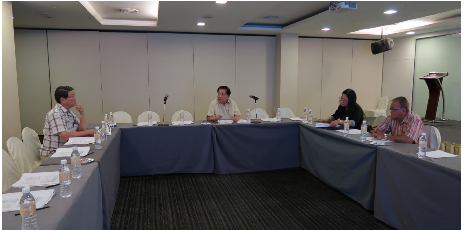
STA Moulding Category Meeting in progress

Meanwhile, members from the STA Timber Products Marketing committee proposed for the relevant forestry agencies to set up a one-stop center to deal with all matters related to downstream processing and also to set up an “E-Sourcing System”.