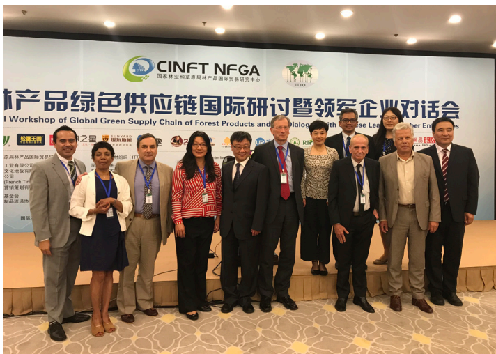
Picture of overseas speakers, Chinese senior Government Officers, ITTO DG (6 th from left) and staff

全球林产品绿色供应链国际研讨会和中国木材业领军企业国际对话会分别于2018年6月21日及2018年6月22日在中国北京国际会议中心举行。此活动由中国国家林业和草原局(NFGA)林产品国际贸易研究中心(CINFT)和国际热带木材组织 (ITTO) 联合主办。