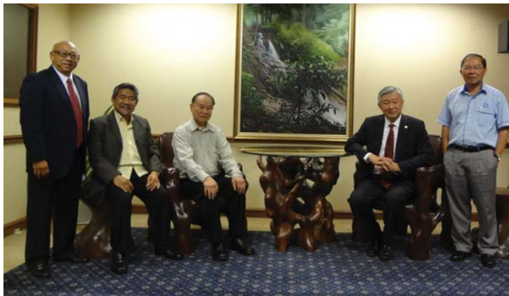
Photo: Office Bearers of the Executive Committee for 2015/2016

The following were elected as members of the Executive Committee for 2015 and 2016: