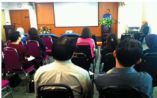
Photo: Consultative Session in progress