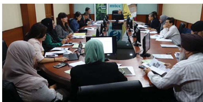
Photo: MTCC AGM in progress