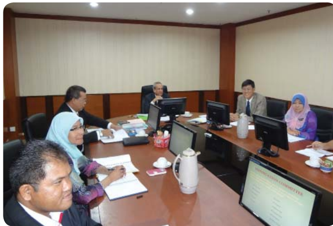
Photo: Meeting in Progress