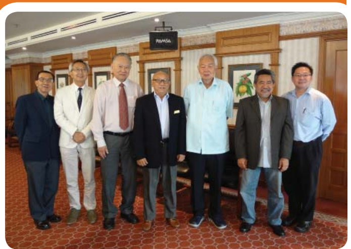
Photo: Group Photo of MTA Executive Members