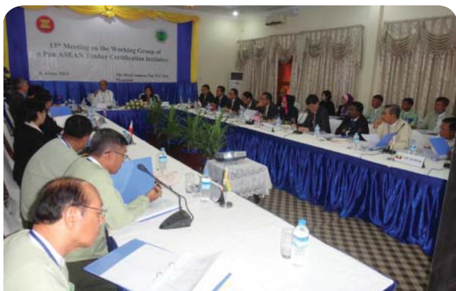
Photo: Meeting in Progress