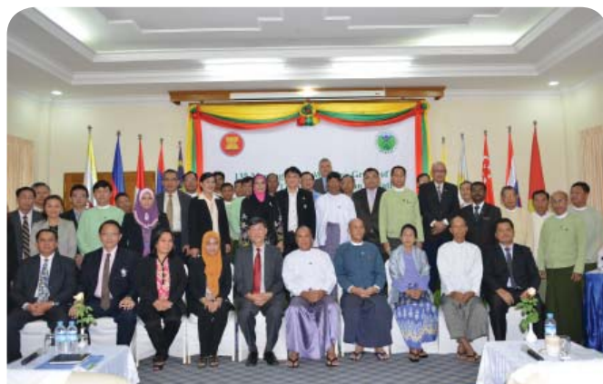
Photo: Delegates from ASEAN Member States

第13届泛东盟木材认证计划工作小组会议(WG-PATCI)于2014年6月3日至4日假缅甸内比都召开。