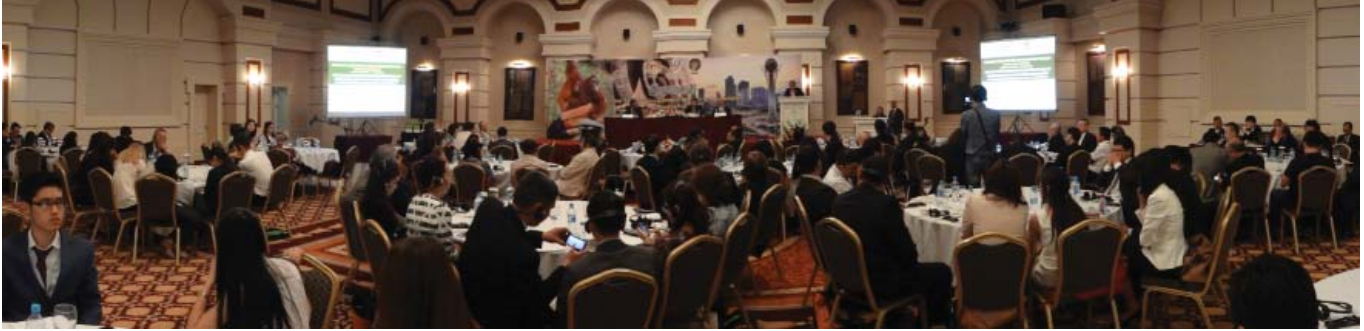
Photo: Seminar in Progress, Rixos President Hotel, Astana, Kazakhstan