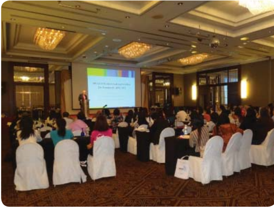
Photo: Seminar in progress

The HR Seminar on Challenges Towards Excellence, organised by the Pembangunan Sumber Manusia Berhad (PSMB), was held at Hilton Hotel Kuching on 23 June 2014. Approximately 100 participants, mostly human resource practitioners from government agencies and private sectors attended this Seminar.