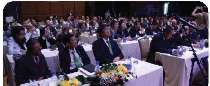
Photo: Seminar in Progress, Ritz Carlton Hotel, Almaty, Kazakhstan