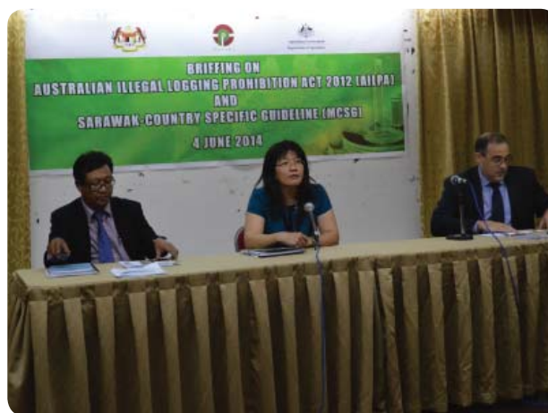
Photo: Question and Answer Session in progress