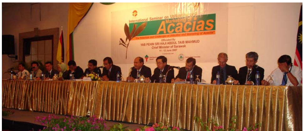
Picture: Panel discussion in session