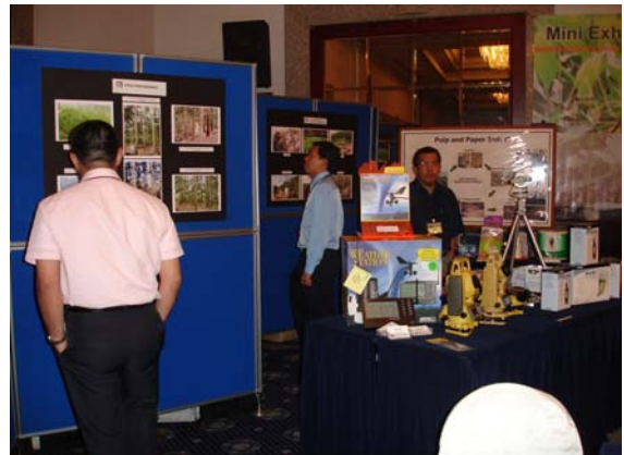
Picture: Some of the exhibits at the Seminar