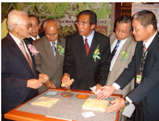
Picture: Looking at some of the samples of some products made from Acacia mangium

The seminar was divided into five sessions covering nine papers.