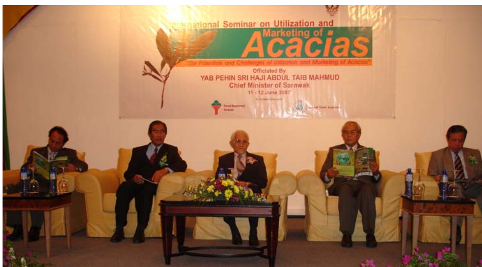
Picture: Guests of honor at the officiating of the Seminar

Sembilan kertas kerja telah dibentangkan dalam lima sesi di seminar.