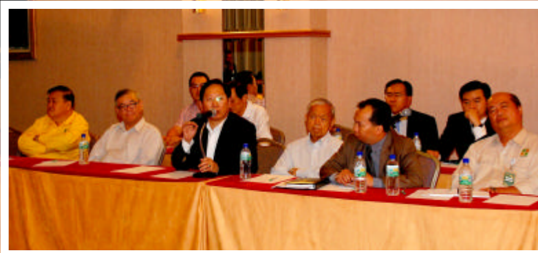
Right: Members making enquiries during the Question and Answer session