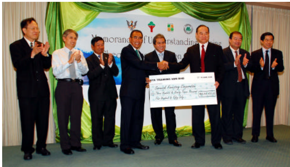
Picture: Cheque presentation to the Sarawak Forestry Corporation for the project entitled "Viability Assessment of Indigenous Tree Species and Propagation Techniques for Planted Forest Development in Sarawak"

In conjunction with this occasion, two cheque presentations to the Forest Department Sarawak and Sarawak Forestry Corporation for the projects entitled "Reassessment of Conservation Status of Three Genera of Dipterocarpaceae ( Dipterocarpus , Dryobalanops and Shorea )" and "Viability Assessment of Indigenous Tree Species and Propagation Techniques for Planted Forest Development in Sarawak" respectively. ❁