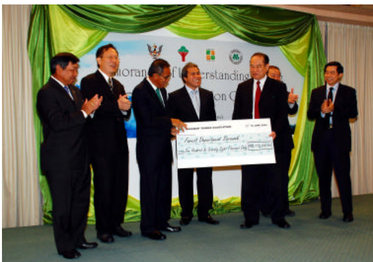
Left: Cheque presentation to the Forest Department Sarawak for the project entitled "Reassessment of Conservation Status of Three Genera of Dipterocarpaceae ( Dipterocarpus , Dryobalanops and Shorea )"