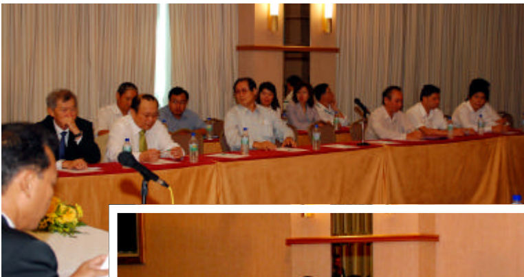
Left : STA Members at the briefing session