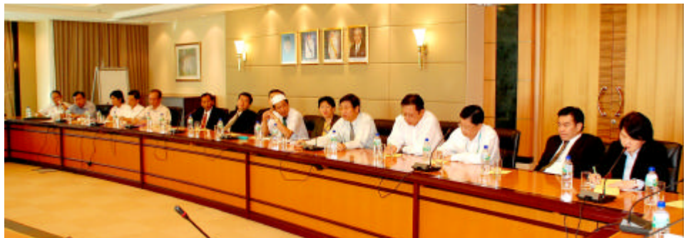
Above and right: Dialogue in progress between representatives from the Forest Department Sarawak, Sarawak Forestry Corporation, Sarawak Timber Industry Development Corporation, Harwood Timber Sdn Bhd and STA Council Members