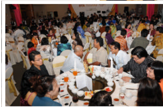
Right: Invited guests enjoying the evening