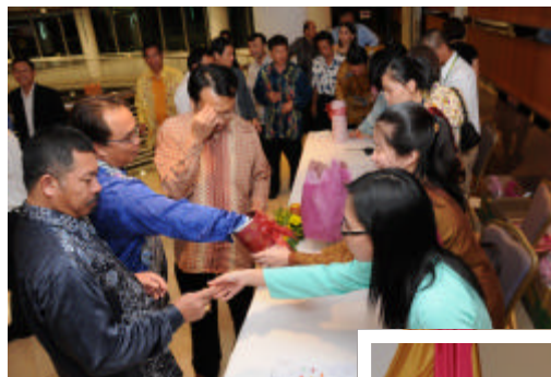
Left: STA Members and staff mingling at the STA Friendship Night

The gathering was entertained to a performance by famous comedian, Mr. Harith Iskandar, a four-piece band and lucky draws. ❁