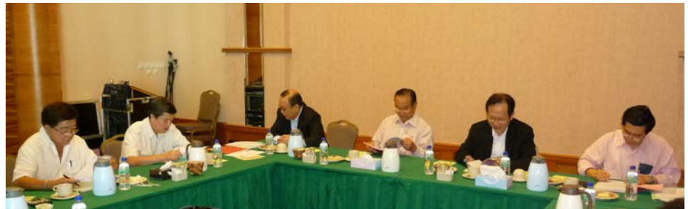
Meeting in session

The Meeting had also resolved to engage two consultants to assist the Association on work related to the Malaysia-EU Forest Law Enforcement, Governance and Trade Voluntary Partnership Agreement, Lacey Act and other ad-hoc issues related to sustainable forest management. ❁