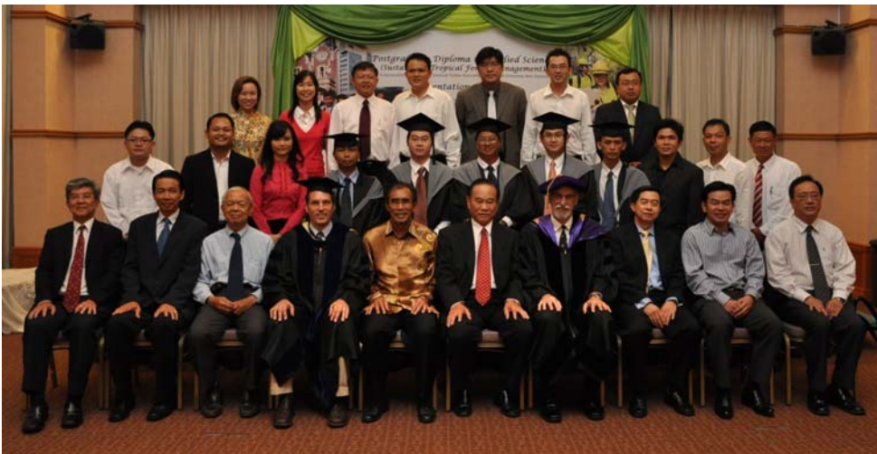
Class of 2008 with distinguished guests

Hutan Sarawak, Sarawak Forestry Corporation dan Perbadanan Kemajuan Perusahaan Kayu Sarawak dan ahli keluarga para graduan.