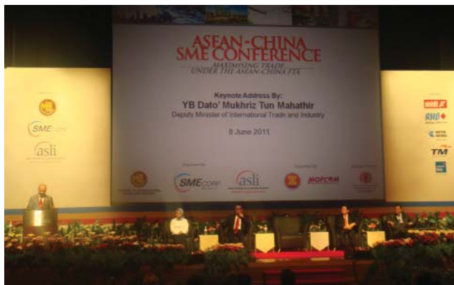
Photo: Conference in Progress

SME Corporation Malaysia (SME Corp.) with the Ministry of International Trade and Industry (MITI) jointly organised the ASEAN-China SME Conference 2011 with the theme "Maximising Trade under the ASEAN-China FTA" from 8 to 9 June 2011 at Kuala Lumpur Convention Centre, Kuala Lumpur.