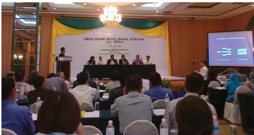
Photo: Briefing in progress

大会旨在加强中小型企业 (SME) 在东盟内以及和中国之间的跨合作，提供商业和投资的最新信息和点子以及提升东盟 SME对东盟-中国自由贸易协定 (ACFTA) 下所创造的贸易机会的意识。