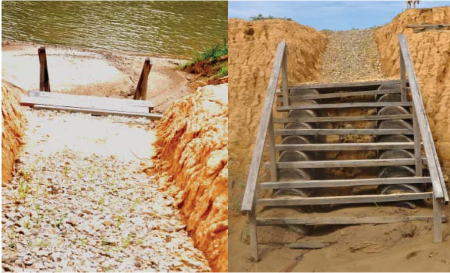
Photo: Construction of the landing stage

STA Mutual Sdn Bhd (STAM) telah menyediakan bantuan kewangan bagi Projek Pembangunan Masyarakat (CDPs) melalui usaha-usaha syarikat Ahli tertentu berikutan hasil-hasil penemuan daripada lawatan-lawatan Penemuan Fakta (Fact Finding) berkenaan Isu-isu Penan-Perhutanan pada tahun 2010 anjuran bersama STA-SFC. Satu lawatan baru-baru ini telah diadakan di Long Balong dari 20 hingga 22 Jun 2011, untuk mengkaji CDP terutamanya tempat pendaratan bot-bot di Long Balong.