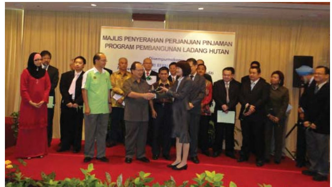
Photo: Representative from WTK Reforestation Sdn Bhd receiving the loan agreement from the Minister of MPIC

Lembaga Perindustrian Kayu Malaysia (MTIB), melalui Bahagian Ladang Hutan telah menganjurkan satu majlis pada 29 Jun 2011 untuk menyerahkan Perjanjian Pinjaman di bawah program Pembangunan Hutan Perladangan kepada sebelas syarikat-syarikat kecil / sederhana dan tujuh syarikat-syarikat besar perladangan hutan berskala komersial dan Pelancaran “Prosedur Operasi Piawai (SOP) Teknikal bagi Spesies-spesies Bukan Kayu Getah”. Majlis pelancaran ini telah dirasmikan oleh Menteri Perusahaan Perladangan dan Komoditi, Tan Sri Bernard Dompok.