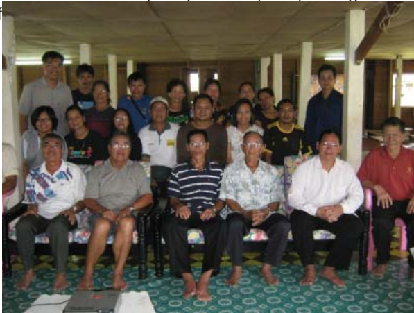
Photo: Participants at the consultation session

The Sarawak Forestry Corporation (SFC) through consultation workshop with representatives from members companies of