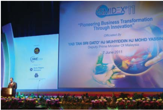
Photo: Tan Sri Dato' Muhyiddin Yassin, the Deputy Prime Minister delivering his speech

SME Corporation Malaysia (SME Corp.) and the Ministry of International Trade and Industry (MITI) jointly organised the SMIDEX 2011: SME Innovation Showcase with the theme "Pioneering Business Transformation Through Innovation" from 7 to 9 June 2011 at Kuala Lumpur Convention Centre, Kuala Lumpur.