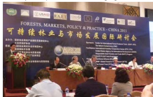
Photo: Launching of the Conference and Workshop

Plenary 5 on Synthesis of Global Trends and Workshop Findings where plenary speakers shared their views on synthesis of global forestry policies and market trends as well as industry's response to the changing business environment.