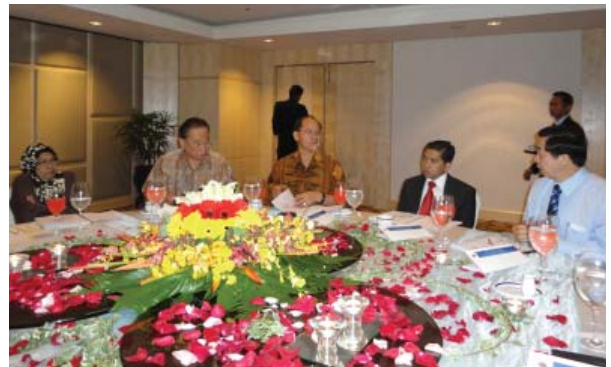
Photo: Discussion in progress with the Chairman and Director-General of MTIB