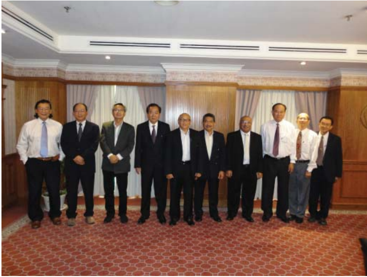
Photo: Group Photo of members of MTA

马来西亚木材公会(MTA)于2011年6月27日假吉隆坡, PGRM大厦召开常年大会。