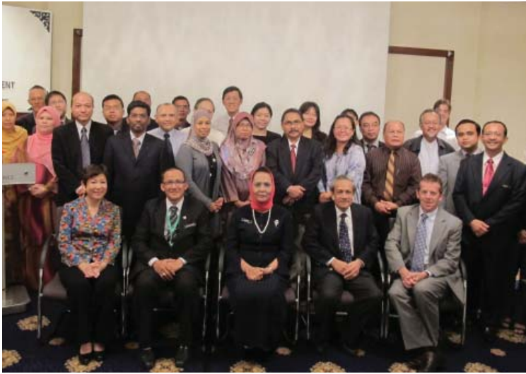
Photo: Group Photo

The Ministry of Natural Resources and Environment (MNRE) and the European Forest Institute (EFI) FLEGT Asia Regional Support Programme (FLEGT Asia) co-organised a meeting on Mapping of Stakeholder Consultation in Malaysia. It was held on 15 June 2011 at the Renaissance Hotel, Kuala Lumpur attended by twenty-nine (29) representatives from the various Ministries, Government Departments/Agencies, Trade Associations, and Environment NGOs of three regions in Malaysia.