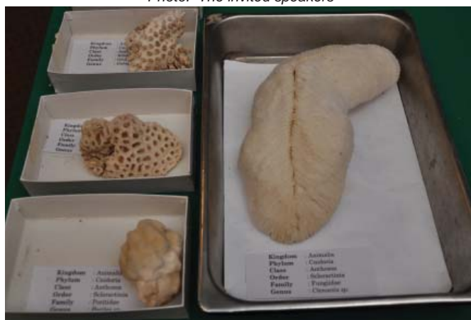
Photo: Coral reefs samples

Persatuan Kayu Kayan Sarawak (STA) telah mengadakan satu ceramah berkaitan 'Terumbu Karang: Kepentingannya dan Tekanan Dihadapi' pada 23 Jun 2012 di Wisma STA, Kuching.