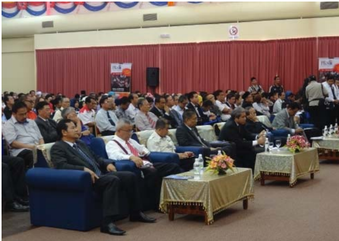
Photo: Participants at the Seminar

Kementerian Pembangunan Perindustrian (MID) Sarawak telah menganjurkan seminar tentang "Program Meneroka Peluang Perdagangan dan Industri, Bahagian Samarahan: Seminar dan Pameran Perdagangan & Perindustrian Sarawak" di Dewan Suarah Samarahan pada 27 Jun 2012.