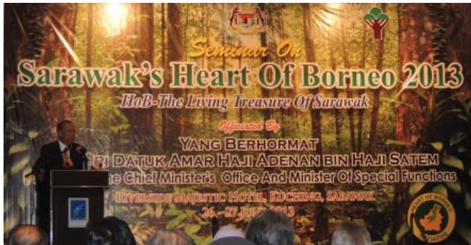
Photo: Seminar in progress

A Seminar on "Sarawak's Heart of Borneo (HoB) 2013 - The Living Treasure of Sarawak" was organised by Forest Department Sarawak (FDS) on 26 and 27 June 2013 at Riverside Majestic Hotel in Kuching. The Seminar was officiated by Tan Sri Datuk Amar Hj Adenan Hj Satem, Minister in the Chief Minister's Office and Minister of Special Function, Sarawak. Approximately one hundred (100) participants from various State and Federal Government agencies, institutions of higher learning, Non-Governmental Organizations (NGOs), private sectors, the media fraternity and a representative each from Brunei and Indonesia attended the seminar.