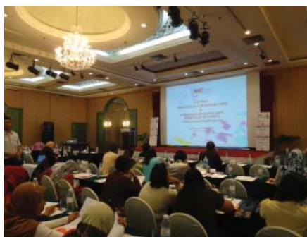
Photo: Briefing in progress

A briefing on Shariah Compliant Small and Medium Enterprise (SME) Financing Scheme and Awareness on Competition Act 2010 and Business Ethics was organised by SME Corp Malaysia on 26 Jun 2013 at the Grand Margherita Hotel in Kuching.