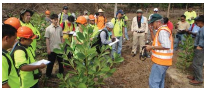
Photo: Field visit