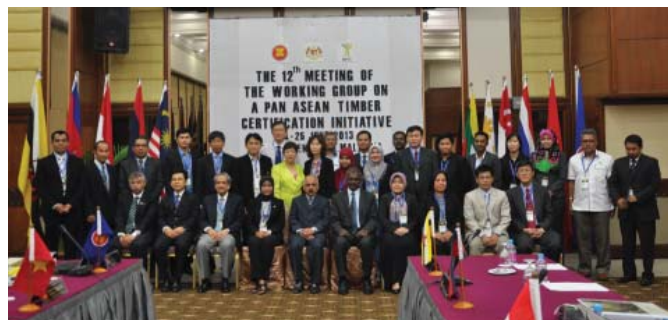
Photo: Group photo