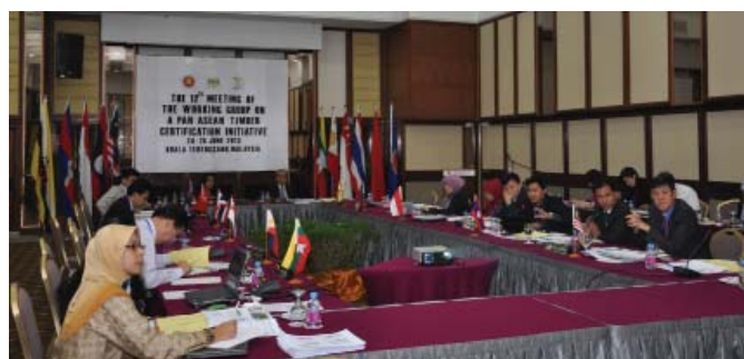
Photo: Meeting in progress

ASEAN Leaders during the ASEAN Summits, the ASEAN Economic (AEC) Council, the ASEAN Economic Ministers (AEM), the Senior Officials Meeting of the ASEAN Ministers on Agriculture and Forestry (SOMAMAF) as well as the ASEAN Ministers on Agriculture and Forestry (AMAF) Meeting on the implementation strategy to deliver the ASEAN Roadmap for an ASEAN Community. She mentioned that in the 21 st ASEAN Summit which was held in Phnom Penh, Cambodia in November 2012, the leaders welcomed the prioritisation of AEC measures undertaken by the AEC Council. The ASEAN Leaders decided that the date of realisation of the ASEAN Community would be on 31 December 2015.