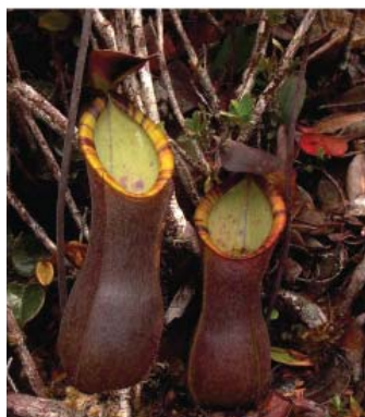
Nepenthes Muluensis Habitat: Mossy montane forests