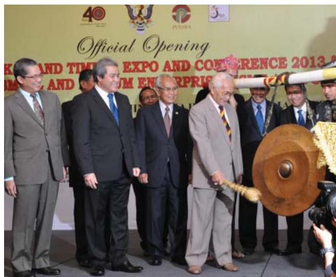
Photo: The Chief Minister of Sarawak, Pehin Sri officiating the Event

The event was launched by Pehin Sri Haji Abdul Taib Mahmud, Chief Minister of Sarawak on 7 June 2013. In his opening speech, he congratulated STIDC on their achievements and said that he is happy with the growth of the timber industry in Sarawak. He also stressed on the importance for the timber industry to expand into planting different species of trees and not only relying on indigenous species. Hence, he encouraged players of the