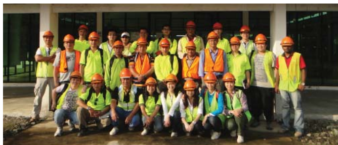
Photo: Group photo