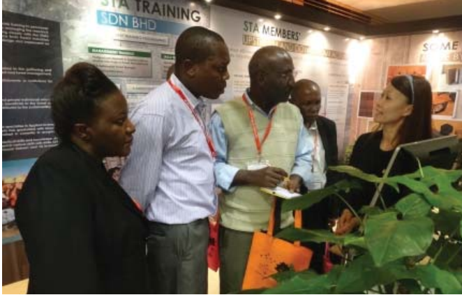
Photo: Visitors from Tanzania at STA's booth