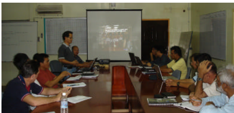
Left: Discussion on the draft MC&I (Forest Plantation)

Intensive discussions were held on the draft MC&I (Forest Plantations), especially the indicators and verifiers for Sarawak. The auditors will take what had been discussed and debated into consideration and they will come out with a report within a month of the field test. 🌸