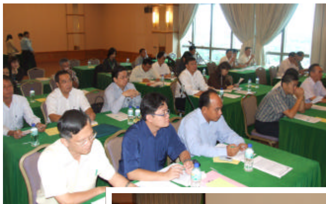
Left: Briefing in progress