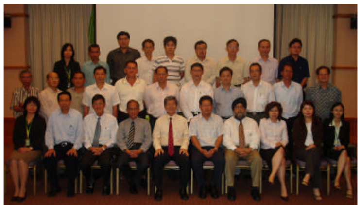
Right: A group photo of participants at the briefing