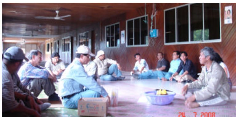
Right: A visit to the local community

Ujian lapangan Kriteria dan Indikator Malaysia untuk Pensijilan Pengurusan Hutan (Ladang Hutan) atau singkatannya "MC&I (Forest Plantation)" telah dijalankan dari 21 hingga 25 Julai 2008 di satu tapak Grand Perfect Sdn Bhd, Bintulu. 23 peserta dari Sarawak Planted Forest Sdn Bhd, Grand Perfect Sdn Bhd, Majlis Pensijilan Kayu Malaysia, SGS (Malaysia) Sdn Bhd, Jabatan Hutan Sarawak (Unit Ladang Hutan), Sarawak Forestry Corporation, Persatuan Nasional Orang Ulu dan STA menyertai ujian ini. Sepanjang ujian ini, para peserta telah melawat tapak semaian Samarakan di mana mereka diberi taklimat tentang penubuhan tapak semaian dan latihan yang dijalankan oleh Grand Perfect Sdn Bhd. Peserta-peserta juga melawat tapak Penyelidikan dan Pembangunan untuk meninjau plot ujian spesis Acacia dari wilayah lain. Mereka juga melawat projek masyarakat tempatan iaitu pemeliharaan lebah di Tatau.