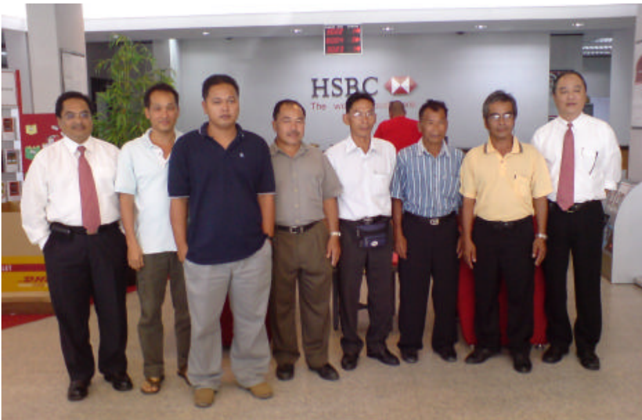
Picture: Community representatives at the opening of an AMC account at an international bank

The pickup truck will complete its chain-of-custody to the Anap Muput Community at Bukit Kana in August 2008. ❁