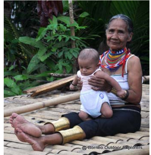
One of the ladies at Kampung Semban who wear brass rings around their ankles and wrists

interesting natural locations in and around Kuching that are rarely known even to locals.