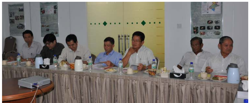
Committee Members in deep discussion

Pada 31 Julai 2009, Ahli-Ahli Jawatankuasa Produk Panel telah mengadakan perbincangan di Wisma STA, Kuching. Ahli jawatankuasa telah bertukar maklumat mengenai pasaran dan membincangkan pelbagai isu-isu lain dalam mesyuarat tersebut.