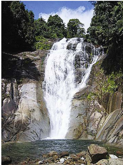
View of the highest waterfall in Southern Sarawak, Jangkar Waterfall