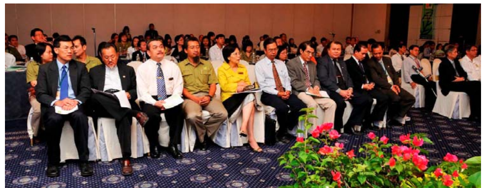
Below: Workshop participants