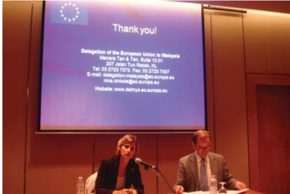
Photo: Briefing in progress

The Malaysian Timber Council (MTC) organised a briefing on Timber Market Regulations in the European Union (EU) and the United States of America (USA) on 16 July 2010 at Menara PGRM, Kuala Lumpur. The objective of the briefing was ensure that organisations, agencies and members in the timber industries are aware of the regulations put in place by the two largest importers of timber products i.e. the EU and the USA.