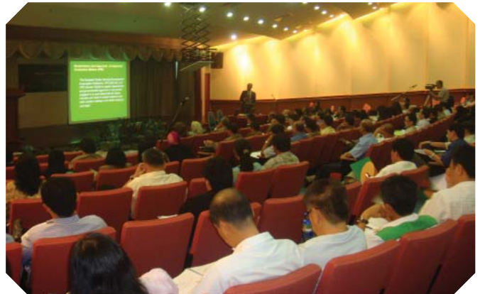
Photo: Briefing in progress