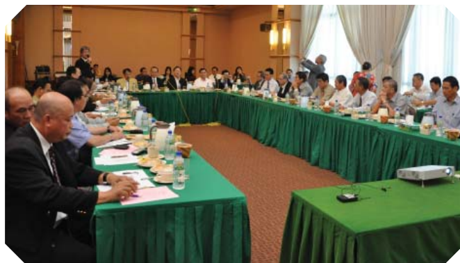
Photo : Meeting between Japan Lumber Importers' Association (JLIA) and Sarawak Timber Association (STA)

随后, 本会于2010年8月3日公布有关 "日本林业署:砂拉越木材和木材产品来自合法资源。" 新闻稿予国内各大传媒。该新闻稿如下: