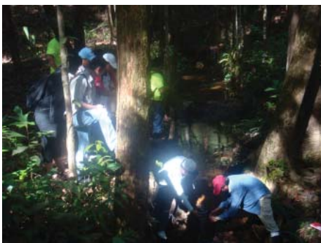
Photo: Students collecting water samples

This part of the course requires the students to deal with the environmental aspects of sustainable forest management. One of the components is to develop an understanding about the importance of environmental indicators in forestry, and the ways to monitor the two key environmental parameters i.e. water and wildlife. With this understanding, forest managers will then be able to anticipate and deal with environmental issues related to certification and logging operations.