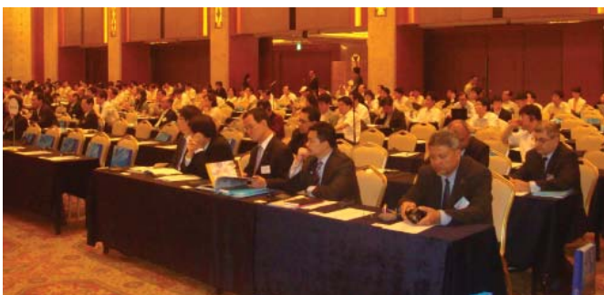
Photo: The participants at the Seminar on Business Opportunities in Malaysia

The Meeting discussed and shared information on the current log situations in Sarawak, market reports, plywood prices and was briefed on the participation in the Trade and Investment Mission to the Republic of Korea organised by the Malaysian Industrial Development Authority (MIDA) and Malaysia External Trade Development Corporation (MATRADE) from 18 – 23 July 2010. In conjunction with the Mission, Sarawak Timber Association (STA) together with a Senior Officer from the Sarawak Timber Industry Development Corporation (STIDC) met up with Korean Counsels, Korea Trade Commission (KTC) and a group of Korean plywood importers. KTC had made preliminary determination on anti-dumping duties on Malaysian Plywood to Korea but has yet to impose the provisional duty due to insufficient data.