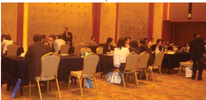
Photo: Business Meeting in Progress