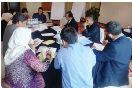
Group discussion

砂拉越木材工业发展机构(STIDC)在Training Hub有限公司的协助下于7月2日至4日, 16日至17日及24日至26日假湖滨酒店举办一系列的砂拉越木材工业工作营(STIL)。