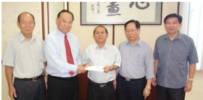
Photo: STA Chairman presenting a cheque to a representative of one of the Schools