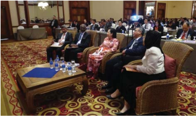
Photo: Workshop in progress

The Ministry of Plantations Industries and Commodities (MPIC) organised a Workshop on the Eleventh Malaysia Plan on 10 - 11 January 2014 in Selangor. The Eleventh Malaysia Plan is the final plan before the year 2020 when Malaysia is targeted to attain a high-income advanced nation status. The Plan will take into account current challenges and emerging medium and long-term global trends as well as the New Economic Model and the National Transformation Agenda, which are at various stages of implementation. This Workshop provided a platform for the commodity industries to provide comments and suggestions related to the commodity industries for the period 2016 – 2020.