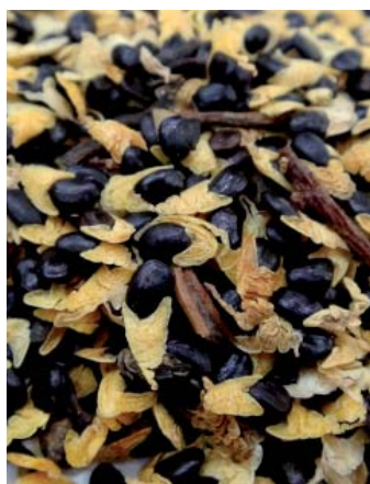
Acacia mangium seeds with yellowish fleshy arils of the funicles. This is the main species, accounting for 72% of the total area planted in Sarawak as at December 2012

is a monthly magazine published by Sarawak Timber Association (STA) for its members. While every effort has been made to ensure that the information printed in this magazine is accurate and correct, neither STA nor its Council Members, Officers or Employees shall assume any responsibility or be made liable for any inaccuracies and errors printed; nor is such publication, unless otherwise, stated, necessarily the views of STA, its Council Members, Officers or Employees. The contents of the STA Review may be reprinted with prior written permission from STA.