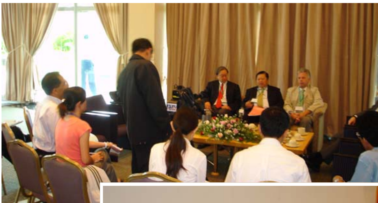
Left: The press conference in progress