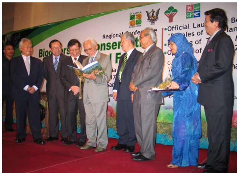
Left: Launching of the book, "People of the Planted Forest"