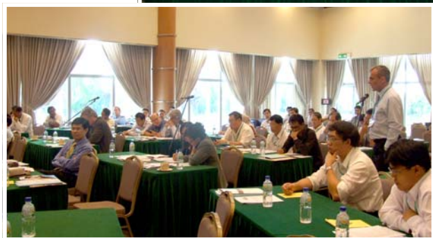
Left: A participant seeking clarification during the Q&A Session