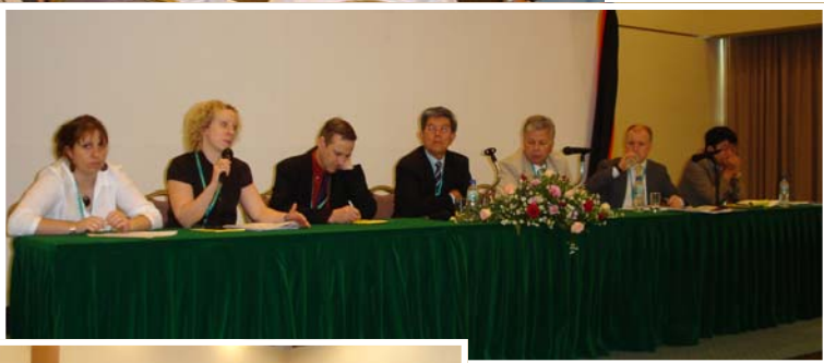
Right: Q&A Session with the panel of speakers