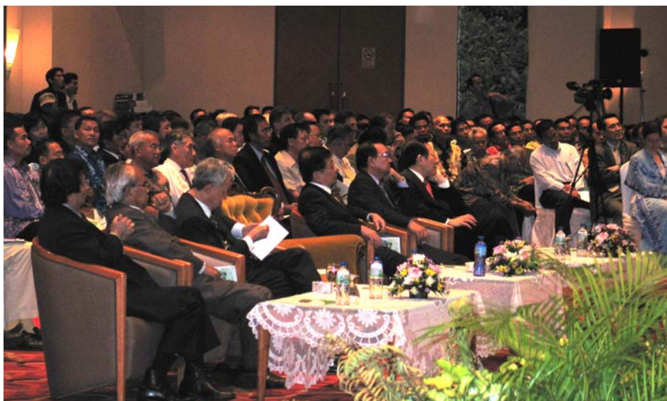
Picture: Dignitaries, participants and invited guests at the official launching ceremony