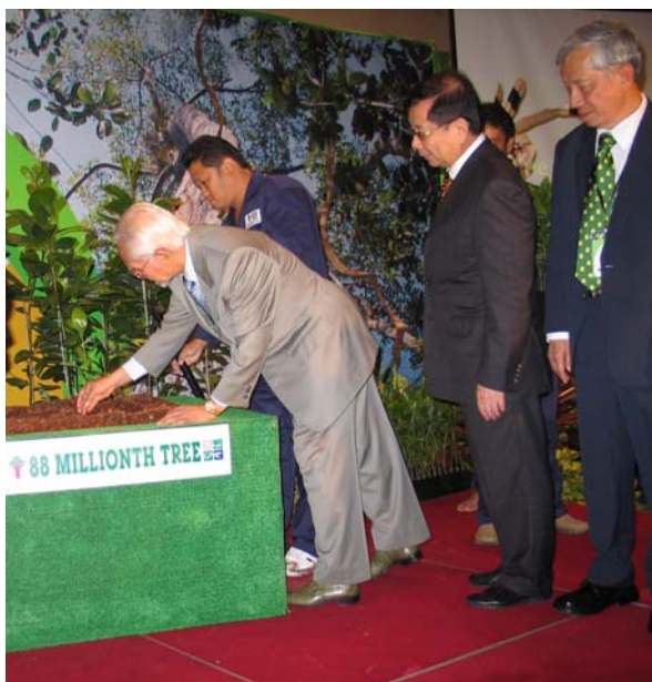
Picture: The Honorable Chief Minister of Sarawak planting the 88 millionth tree

The book on "People of the Planted Forest" presents pertinent information about the Planted Forest Zone (PFZ), and offers readers a look at the people living therein. The book also presents information on plantation of Acacia mangium in the PFZ, Community Development Programmes (CDP) within the PFZ