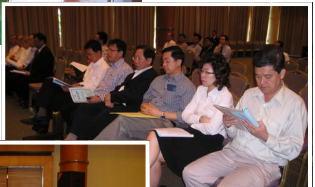
Right: Members at the meeting