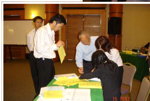
Left: Collection of ballot papers