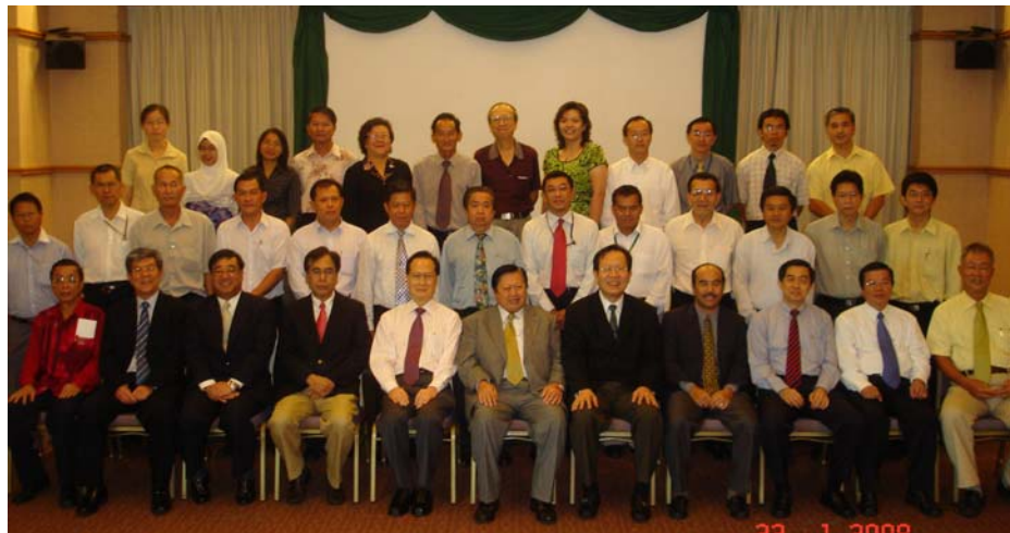
Below: Group photo with the representatives of the Private Chinese Secondary Schools and various scholarship recipients